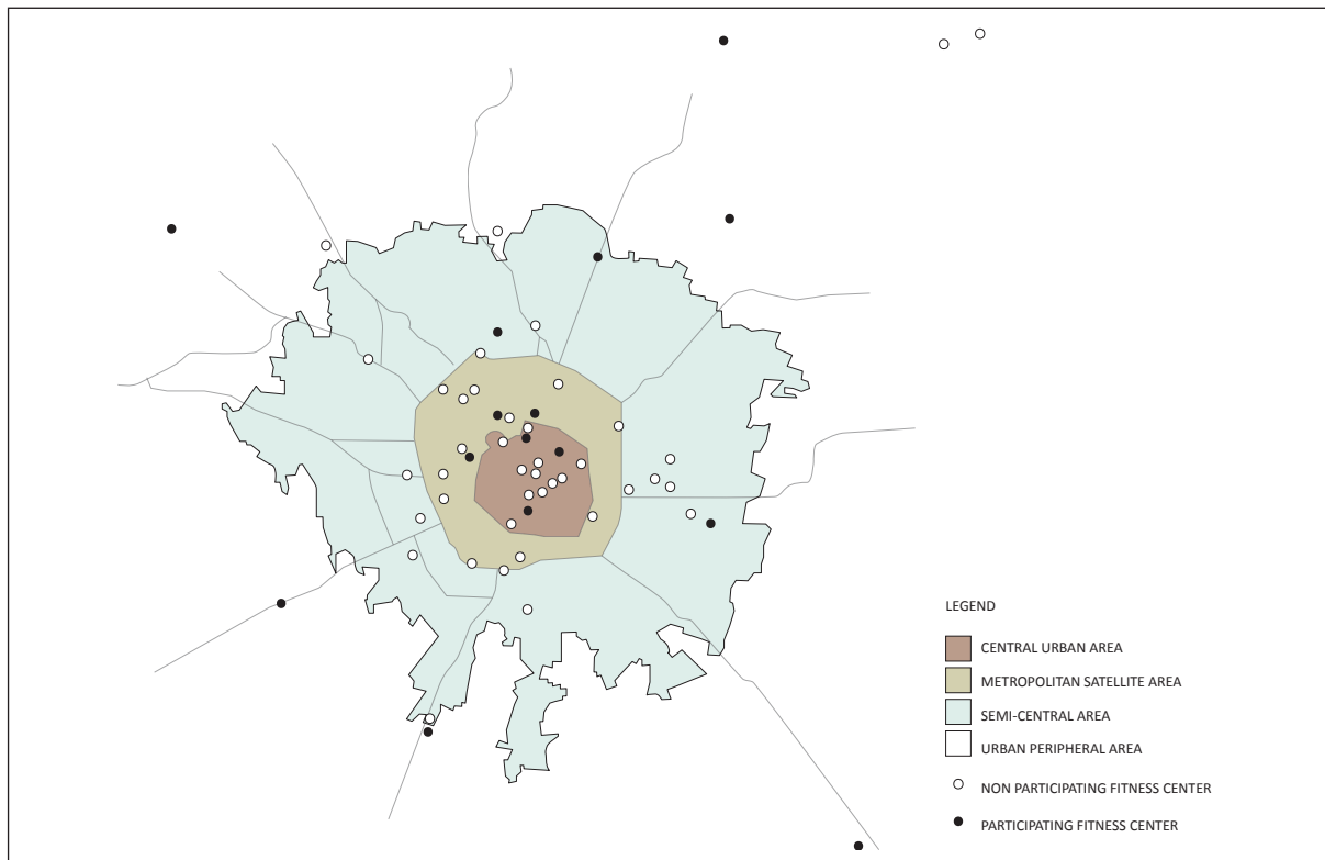
Figure 1 Map of the structures contacted and analysed for a survey. The sample is various and covers the whole territory of Milan.