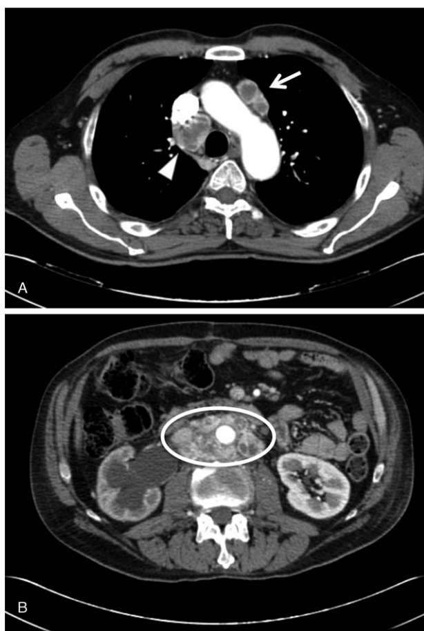
Figure 2. TC whole body: radiological evidence of disease progression. (A) Pathological over diaphragmatic lymph nodes, arrow indicates prevascular lymph nodes, triangle indicates lymph nodes in the Baretz region. (B) Pathological under diaphragmatic lymph nodes, circle indicates para-aortic, paracaval and intercavo-aortic lymph nodes that include cava vein, aorta and right ureter.