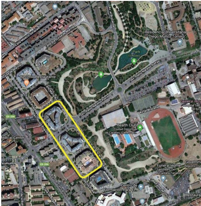
Figure 1. Neighbouring communities of dwellers participating in the study (highlighted in yellow), and surrounding areas.