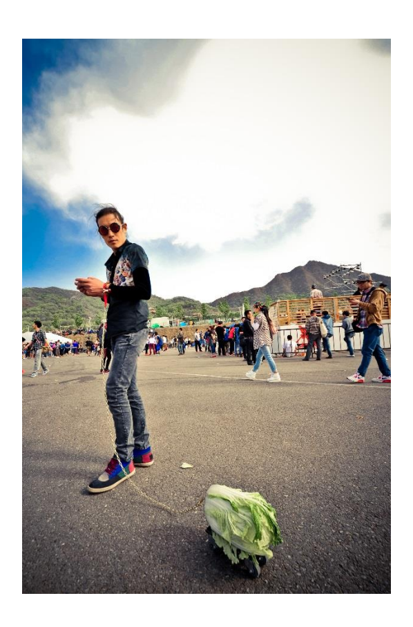
Photo 3: 'Walking the cabbage' to signify social isolation in everyday life; by Wuhujun

Other performing arts used sarcasm to criticize societal problems. For example, 'walking the cabbage' (see photo 3) symbolises young people having too much pressure and few friends in real life. They are left with only the company of a cabbage which is seen as lonely and ordinary. Other slogans such as 'Marriage-seeking' satirize the utilitarianism of marriage in Chinese society and 'Free hug' points to the lack of love and trust between people particularly in cities.