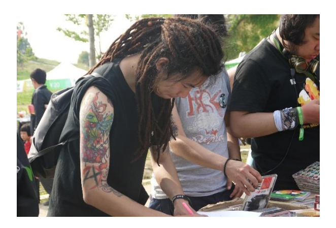
Photo 1: Dreadlocks and tattoos rarely openly displayed in Chinese society

Anti-structure art forms embodied by festival-goers also contributed to the forming of ideological communitas. For example, Mohican hairdos, dreadlocks, tattoos, punk clothes, and T-shirt slogans such as 'fight all inequality forever', 'justice, freedom' were commonly seen.