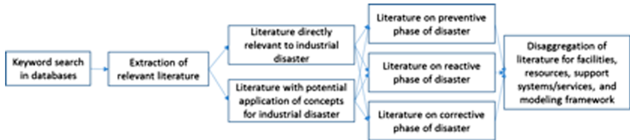
Figure 1. Methodology used for the literature review

Similar to the techniques used by Benet-Zepf et al. (2018) and Marin-Garcia and Martinez-Tomas (2016), the literature review methodology used in this paper uses a streamlined and systematic process as shown in Figure 1. The search started with the keyword search and then examining the literature for their relevance in industrial disaster.