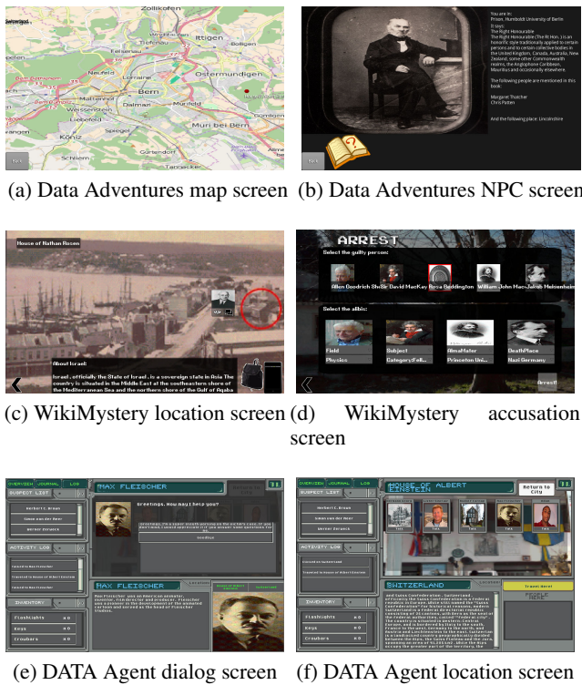
Figure 1: Screenshots from the different games in the Data Adventures series. Sources: (Barros, Liapis, and Togelius 2016a; 2016b).

gelius 2016a; Barros et al. 2018b) and DATA Agent (Barros et al. 2018a). Each evolved from the previous one, with DATA Agent being the most recent, complex and powerful. Most of the gameplay, however, is the same: a point-and-click interface inspired by “Where In The World is Carmen Sandiego?” (Brøderbund Software 1985).