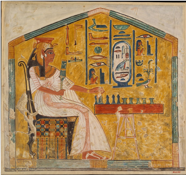
Fig. 1 Queen Nefertari playing Senet (c.1279–1213BC).

An ultimate goal of the project is to produce a “family tree” of the world’s traditional strategy games, with which the dispersal of games and related mathematical ideas might be traced throughout recorded history. Traditional strategy games are those with no proprietary owner [2, p.5] that exist in the public domain, and in which players succeed through mental rather than physical acumen. This study will cover the full range of such games throughout recorded human history, i.e. from around 3500BC, from all countries and cultures worldwide. This paper gives a brief overview of this project, which is still in its early stages, with an emphasis on relevant AI aspects.