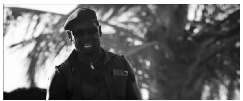
Figure 1-2. "Demand Image", from Blood Diamond.

In figure 1-2 above, the RUF Commander is talking to the prisoners. Yet, due to the close shot and to his position, it can be surmised that the image aims at prompting a specific reaction on the part of the viewers, who can empathise with the prisoners that are the real target of the commander's utterances.