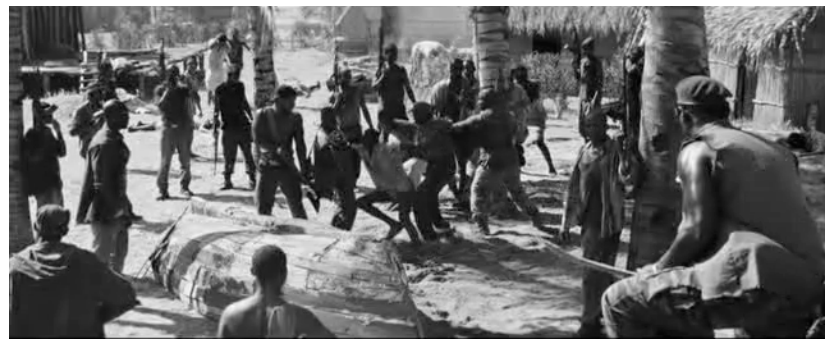
Figure 1-1. "Offer Image", from Blood Diamond.

Besides the distinction between reactional and action processes, images may also be classified in terms of the receivers' response that they are supposed to demand. It is therefore possible to produce "offer" or "demand images". The former label identifies the pictures that only represent an ongoing process or situation, offering "the represented participants to the viewer [... as] object of contemplation" (Kress and van Leeuwen 2006: 119). The latter type of pictures demands a specific reaction from viewers, by locking eyes with the receivers, in order to establish relations "of social affinity" with viewers (Kress and van Leeuwen 2006: 118). Figure 1-1 below is an example of "offer image":