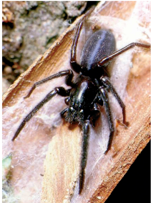
Fig. 3 - Female of Segestria florentina , (loc. "Le Cesine" Vernole - Lecce, 10th September 2001), length 23 mm.