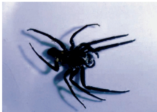
Fig. 2 - Female of Segestria florentina (Rossi, 1790), like report shown to the authors.