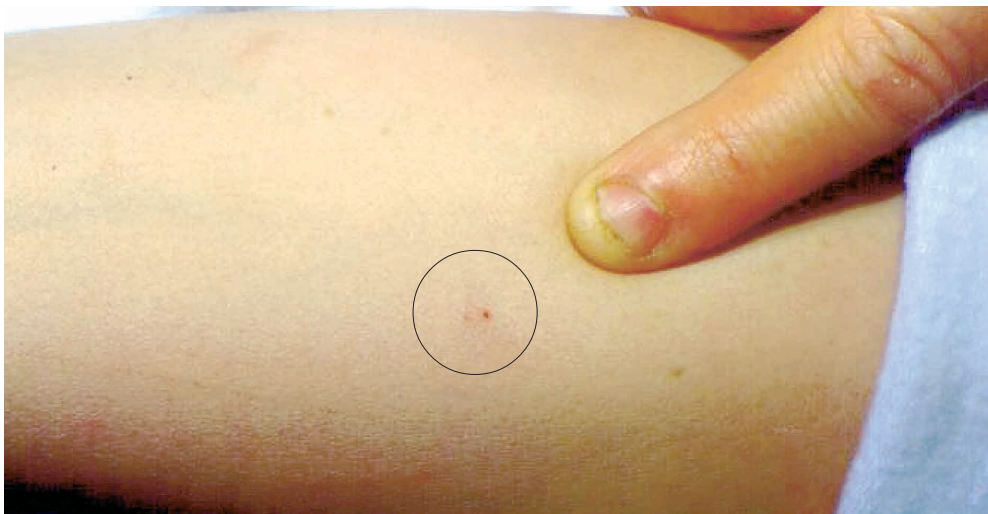
Fig. 1 - Swelling and reactive field in the seat of the bite. You can see two small holes on the internal site of left forearm, nearly seven hours after the bite.

The bitten area caused an intense pain and within a few minutes the pain had spread to the entire left arm; 15 minutes later she experienced a rapid stiffening around the area bitten with paresis of the left arm (Mrs G. said she was unable to clinch her fist). Around the two puncture marks, point of entry of the poison, with a distance of about 5 mm from each other, a discolouration occurred (purple-red) with a diameter of 12 mm, which disappeared within a few hours (Fig. 1).