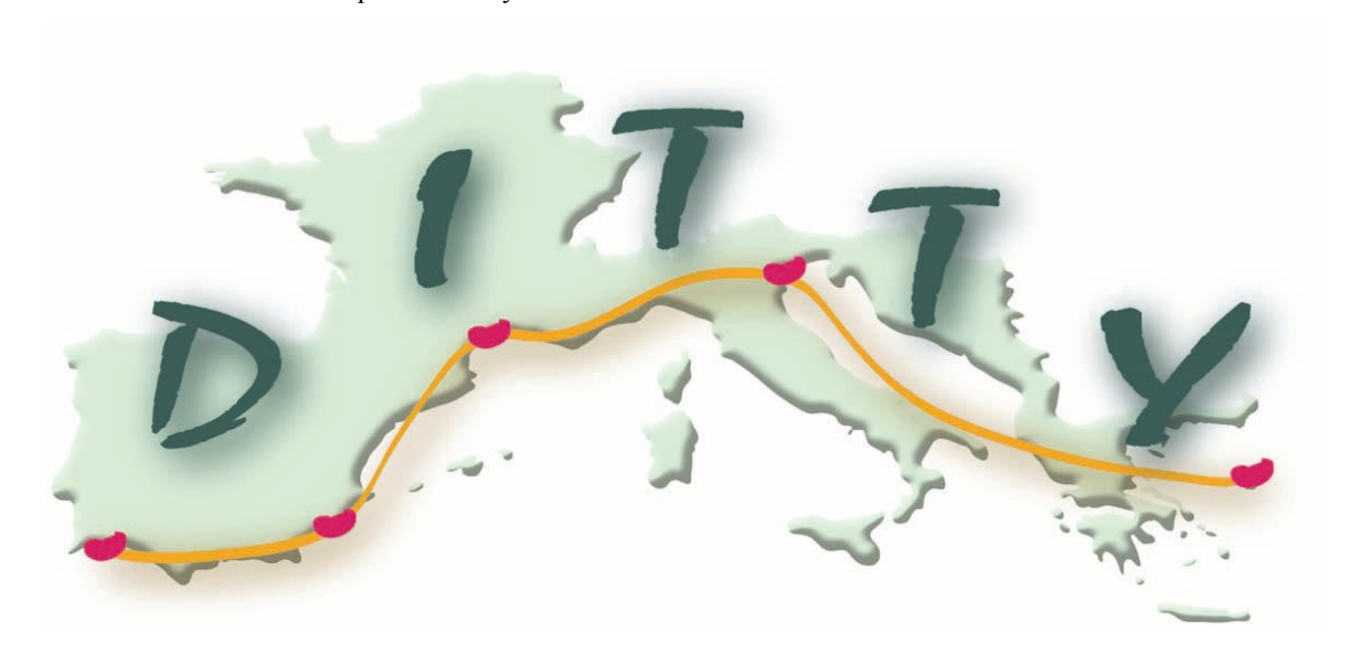
Figure 1. Map of the Southern Mediterranean Arc with the location of sites considered in the DITTY project.

probable or preferable futures and not only possible futures. This is especially true since we screen various management options in order to attain a "good ecological status" for lagoons, as indicated in the WFD. They are forecasting as we take the present as a starting point. They will be, in a second step, put into a DSS which will, according to economical and environmental criteria, help in ordering the results using multicriteria analysis and hierarchical classification. In any case, they are not meant to