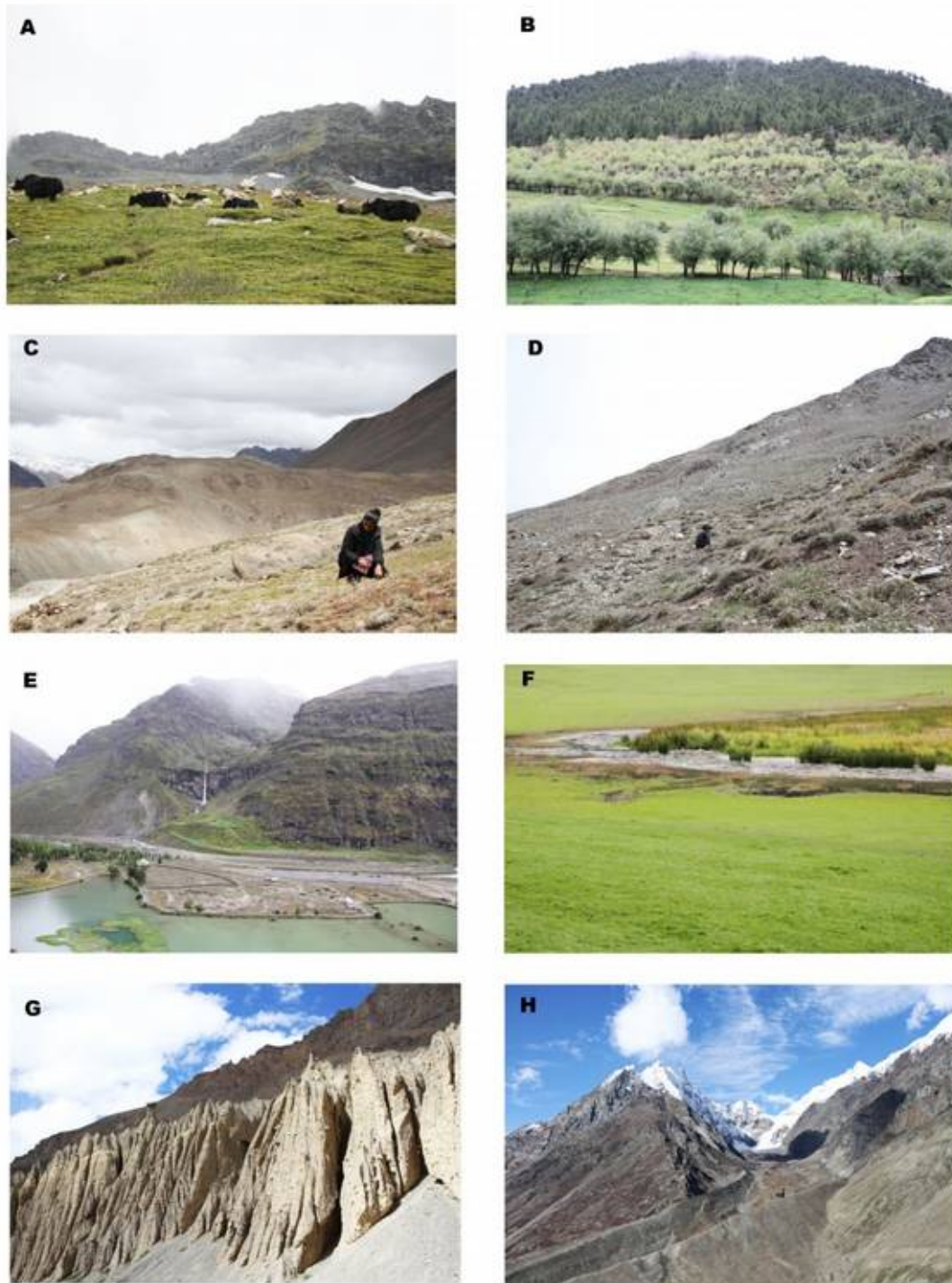
Fig 2. A & B Alpine arid pastures (AAP) of Gramphu and Pattan Valley; C & D Alpine arid scrub (AAS) of Kunzum Pass and Pin Valley; E & F Marsh meadows (MM) of Salpat and Tandi; G & H Denuded landscape & Glacial moraine in Spiti valley.

The floristic diversity of the region is of steppe type which is rich at lower elevations but becomes poorer upwards (17) Aswal and Mehrotra (18) in their phytogeographical studies on the flora of Lahaul-Spiti, reported that the flora of the region shows more affinity with the mountain flora of the Middle Asia. Report of Eco Task Force on Grasslands and Deserts (19) categorized vegetation of the region into Alpine arid scrub (AAS), Alpine arid pastures (AAP) and Marsh meadows (MM).