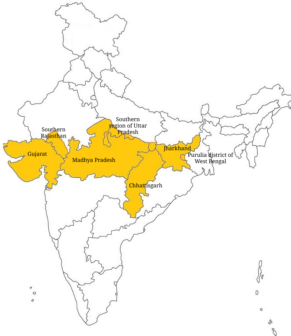
Fig. 2. Map of India (not to scale) showing proposed extent of Central Indian bryogeographical zone

1000m, provides unique opportunities for bryophytes to flourish. The area has recently been investigated by different workers, particularly Chaudhary et al. (2006) who provided an account of 67 species of bryophytes from the state.