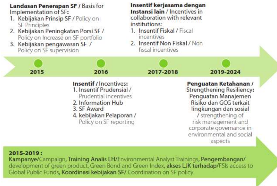
Figure 2. Sustainable Finance Roadmap