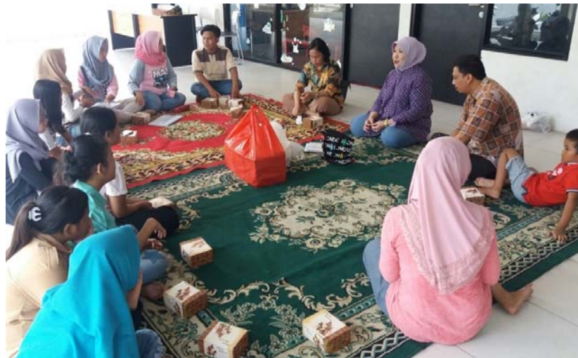
Figure 3. The socialization of the development of adolescent characters behaves healthily at RPTRA Matahari

Phase 4 is a socialization of the development of youth character in healthy behavior. This activity is carried out to remember to adolescents that healthy living behavior will help teens from being addicted to pornography. This activity was carried out on October 14, 2017 at RPTRA Matahari, Maphar Village, Taman sari District, West Jakarta.