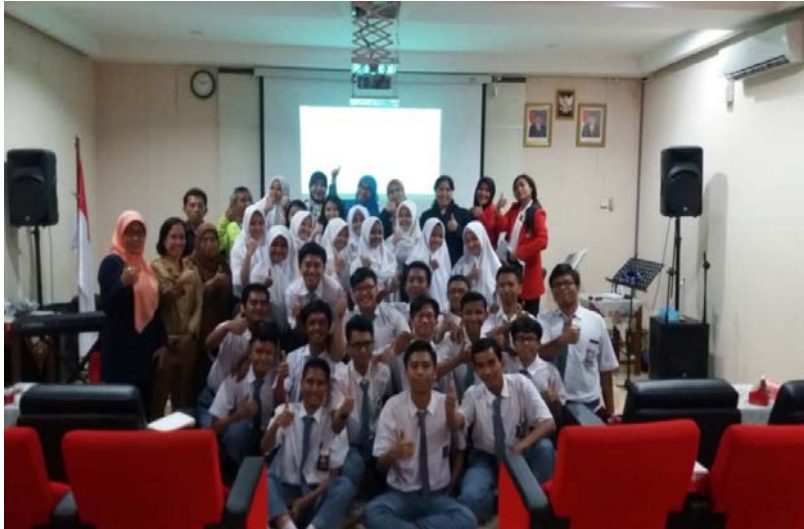
Figure 2. Socialization and education of brain damage due to pornography in the Hall of SMAN 17

Phase 3 is a literacy of curative and preventive actions related to pornography addiction. At this stage, what curative and preventive actions should be explained should be done so that individuals understand and can anticipate addiction to pornography. This activity was carried out at SMAN 17 on October 31, 2017.