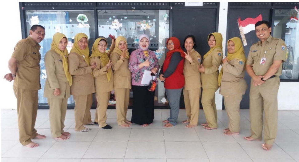
Figure 1. Social mapping related to pornography and determination of location of activities at RPTRA Matahari