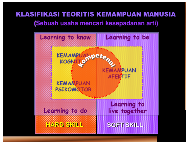
Fig 1. The learning process

In the practice of learning, learning resources must be developed in the presence of the above pillars and make the paradigm a lifestyle (life skill). The learning process will run optimally if we succeed in building skills known as cognitive ability, affective ability, and psychomotor ability. As seen from this scheme.