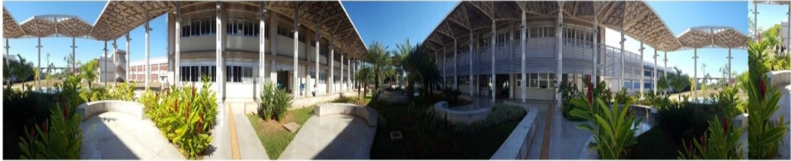
INSTITUTE OF BIOLOGY - IB