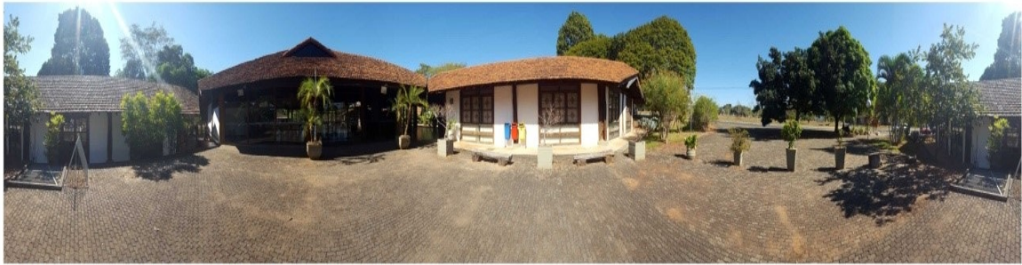
CENTRE OF EXCELLENCE IN TOURISM - CET