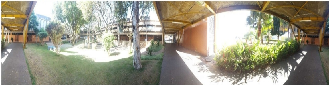
FACULTY OF LAW - FD