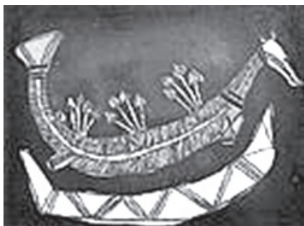
Fig. 4: Arnhem Land painting of the daughter of the original female Rainbow Serpent, Yingarna. Artist Bardiya Nadjamerrek. Aboriginal Art Online

As this quote implies, there are multiple “Rainbow Story Places” all over Australia, containing serpents of various kinds. These can be female or male, and are often apparently androgynous. Not only does their dual gender underline their role as equal life creators, it also contrasts with more dualistic visions in which “nature” is envisaged as female.