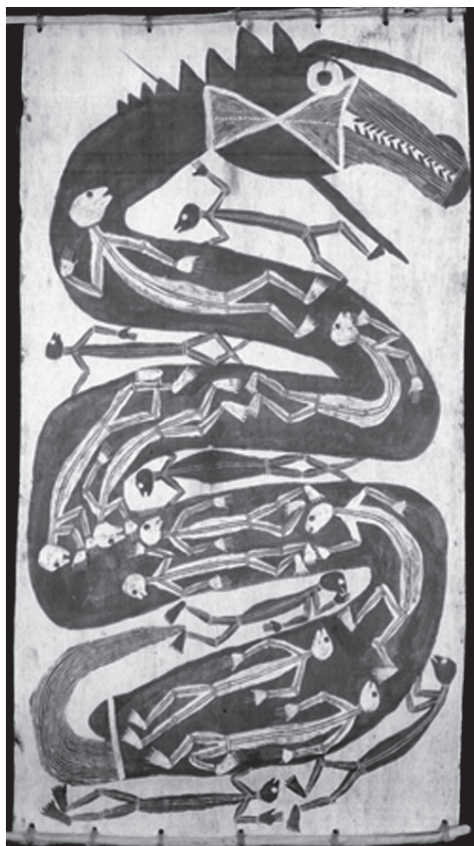
Fig. 2: Arnhem Land bark painting, showing Rainbow Serpent with ancestral beings inside. Pitt Rivers Museum Oxford