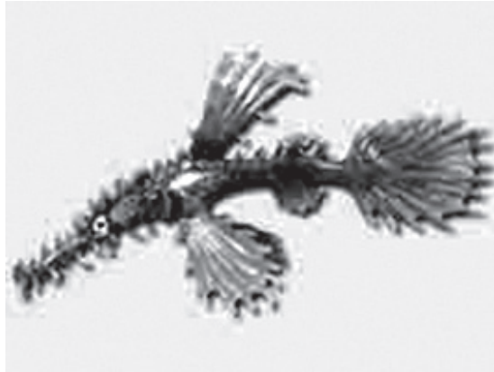
Fig. 1: Pipefish, from Tacon et al 1996

The commonalities that recur in the form of water beings and the ideas they express can therefore be supposed to have a dual basis: in the spatio-temporal transmission of ideas and practices, and in the common material characteristics of water, water-like creatures, and local aquatic fauna, and the use of these as an imaginative resource.