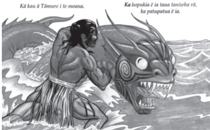
Fig. 10: Tāmure defeating the taniwha . Artwork by Manu Smith (in Bacon 1996:12)