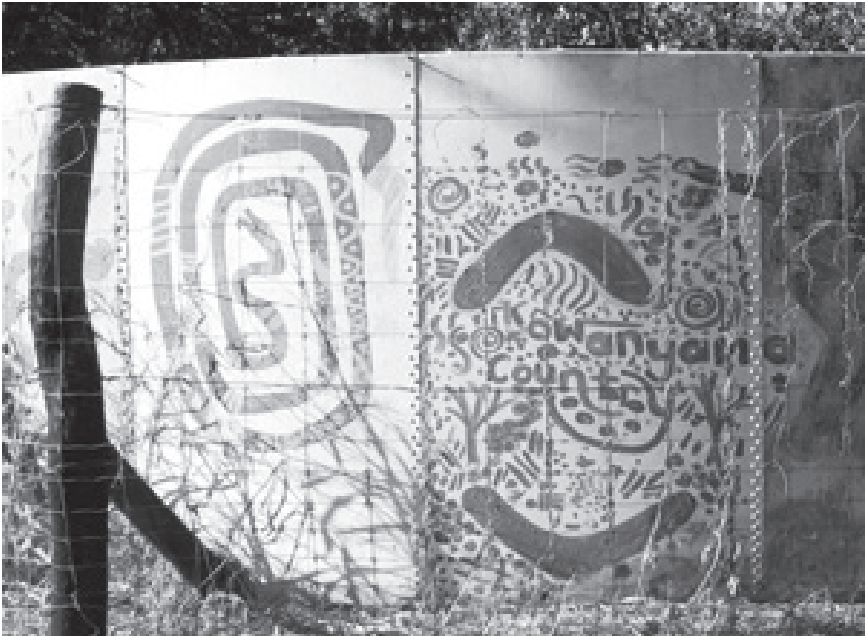
Fig. 6: Rainbow Serpent on water tank in Kowanyama, north Queensland

While there have been some efforts to promote the idea of bi-cultural governance in Australia, the small Aboriginal population, for the most part, retains aims that sit outside rather than in partnership with those of state and national governments. In a variety of ways, indigenous people continue to resist the imposition of governance, creating, in their own communities, what Scott describes as areas of Zomia which in subtle ways try to evade state and federal control (2009). Their aspirations are to maintain their own trajectory of development, and to support lifeways that adhere to their own beliefs and values. In this context it could be said that the Rainbow Serpent continues to maintain a powerful presence, resisting mainstream flows and regenerating a subaltern cosmos.