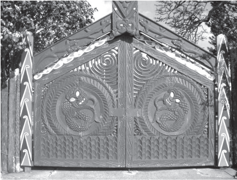
Fig. 8: Taniwha on the Main Gates at Turangawaewae Marae in Ngaruawahia.