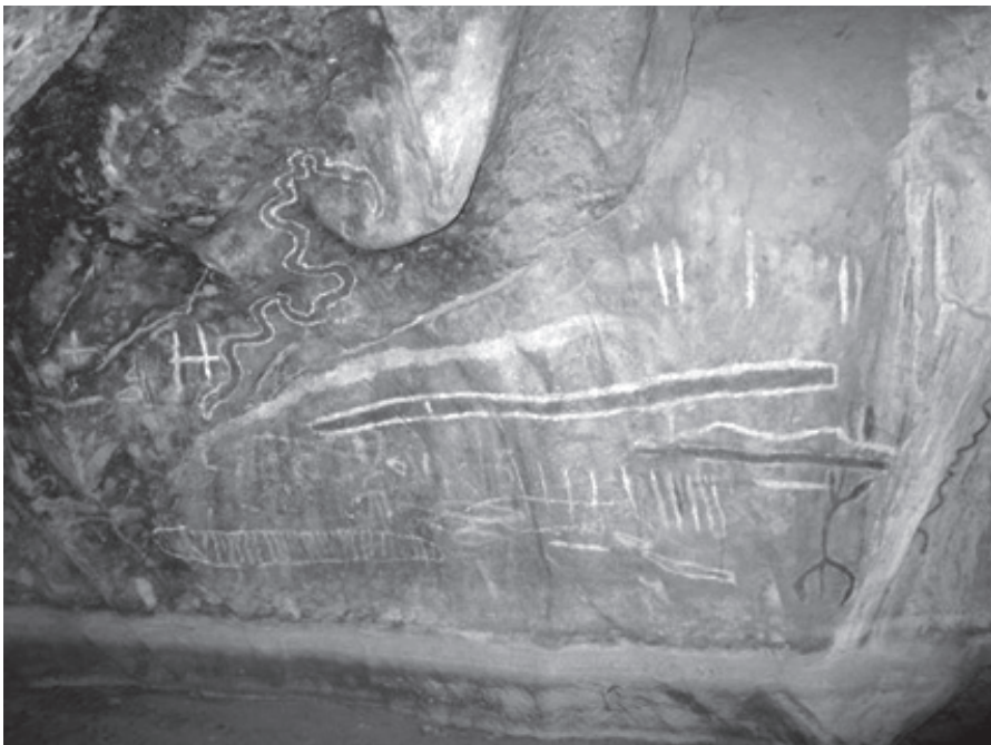
Fig. 5: Rock art serpents in Mungana Caves, north Queensland

The Rainbow Serpent (or Rainbow as it is sometimes called) is not merely expressive of water, it may be said to be composed of water, representing aquatic flows through the environment (Strang, 2002, 2009a. See also Barber, 2005; Morphy and Morphy, 2006). Thus in Cape York, indigenous elders explain that the visible semi-circle of the rainbow, which arches over the land, is linked with its invisible “other” half, which inhabits the underground domain of the ancestral forces. Like water – as water – these forces creatively generate everything that is materialised and “becomes visible” in life and which, at death, returns to this immanent pool to be hydrologically recycled. In the Dreamtime, the Serpent generated the totemic species, usually animals and birds, 4 who became the ancestors of subsequent human clans. It carved out rivers, pushed up hills, and created whole species of plants and animals before pouring back into the ground, where it remained, emanating power that even now has to be approached with care. Thus the most dangerous sacred sites (or poison places as they are called in northern Queensland) are those of Rainbow Serpent beings.