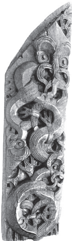
Fig. 7: House post (epa) in Taranaki, 1919. The figure at the top is a marakihau, or sea taniwha. Carving by Te Tuiti-Moeroa. Puke Ariki - Taranaki Museum & Library

this creative era: ancestors who journeyed, hunted, fished and so forth. For example, New Zealand itself was pulled up out of the water by Maui, a major creative figure.