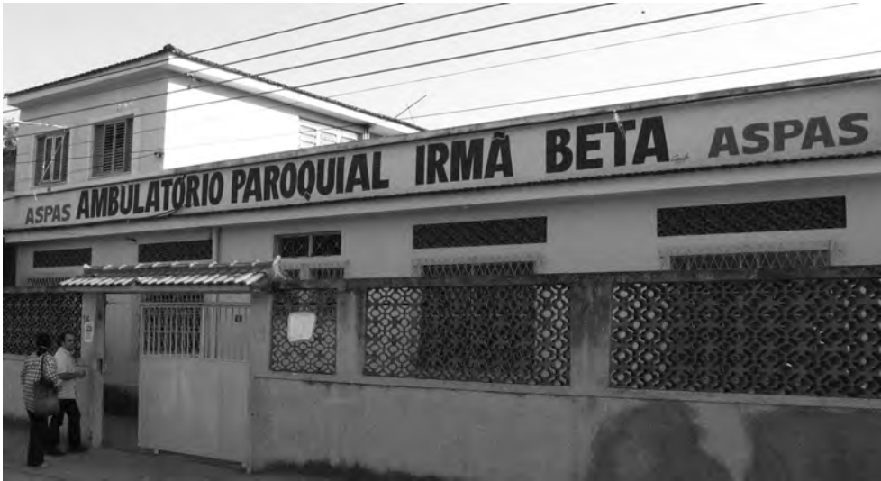
Figure 3. ASPAS