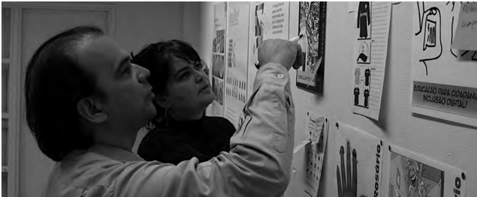
Figure 12. Testing the designs with doctors