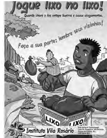
Figures 7-8. One of the tuberculosis posters; a poster teaching children hygienic habits; a poster teaching the proper treatment of garbage

The format of the booklets came from an observation telling that children enjoyed comics, but parents seldom had money to buy them to them. With the format, we were also able to communicate causalities in the disease process. Figure 9 shows a comic that taught people about the most typical symptoms of tuberculosis, and about the treatment process. The