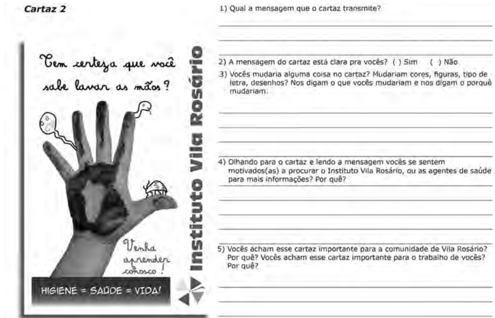
Figure 11. Example of a test of a hygiene poster

Some designs were refined. For instance, one of our posters (Figure 11) was about the importance of hygiene and of keeping the hands clean. The tests indicated that the poster is clear: it shows the bacteria and germs and how they get into the hands, tells people to keep their hands clean, and that need soap for proper washing. This poster also reached not only children, but also adults. However, we learned about problems in typography and changed the letters T and P to be more legible.