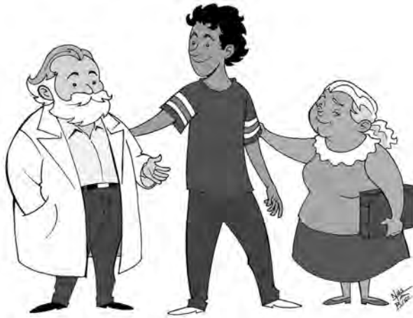
Figure 6. Some characters from fictional Vila Rosario: doctor, local young man, health agent

We took our cue again from Ehn (1988), who had borrowed Ludwig Wittgenstein's notions of language games to justify using experience-near design tools instead of abstractions from universities (Ehn 1988; Ehn and Kyng 1992). The first step in our work was creating a design library filled with graphic characters from Vila Rosario. Figure 6 illustrates some characters of the library.