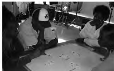
Figures 10 and 13: Figure 10. Participants filling the tests, Figure 13. Tests in Namibia