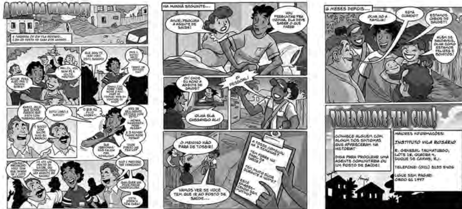
Figure 9. From a comic teaching about the symptoms of tuberculosis

message was hopeful though demanding: there is a cure, but to get well, the medicine has to be taken until the disease agent has left the body completely.