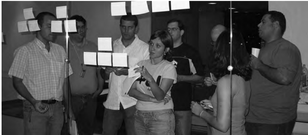
Figure 5. Analysing data in Brazil with psychologists, designers and doctors

As Freire adamantly notes, researchers need to build their view of the community not only on local visions, but also on expert opinion. In analyzing our data, we therefore conducted a series of workshops with Brazilian experts to make sure we had access to a broader context than Vila Rosario alone (Figure 5).