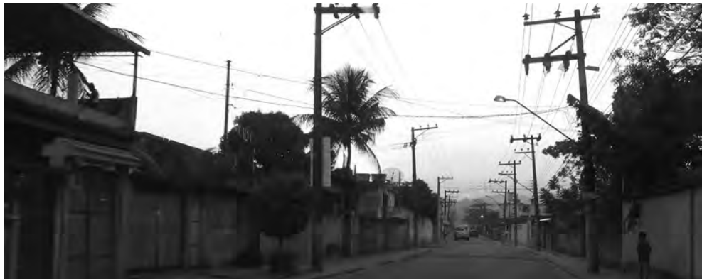
Figure 1. From the front of Instituto Vila Rosario. Health Agents are on the left side on the sidewalk.

Vila Rosario is the name the Society of Fine Chemistry to Fight Against Tropical Diseases (QTROP) gave to designate an area larger than only Vila Rosario's neighborhood. They call the area "The Great Vila Rosario." It is situated between the rivers Sarapui and Iguaçú, and it is connected to the Rio de Janeiro downtown area to Guapimirim and west with the Belford Roxo Municipality by railroad (Costa-Neto 2002). Administratively the area is located in the second district of the city of Duque de Caxias (region of Gramacho).