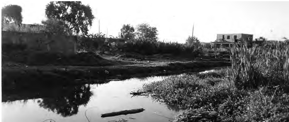
Figure 2. Some of the wetlands in Vila Rosario. Lush growth benefit from heat and nutrition-rich water.