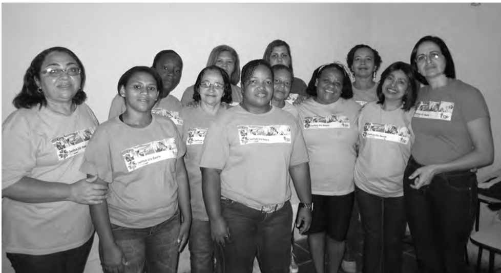
Figure 4. Health Agents in 2008

With the FAP grant, IVR hired a group of Health Agents, women recruited from local population. Their job was to be the foot soldiers of the campaign against tuberculosis. They did home visits to search new cases of tuberculosis, to guide in treatment, and to make sure