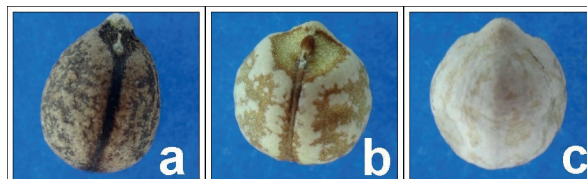
Figure 2. Classification of the seed coat of the seeds of Euphorbia strigosa based on the brightness of color brown; dark (a), medium (b) and light (c).

The experiment treatments were distributed using a complete randomized design.