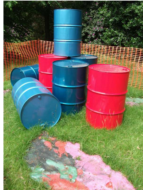
Fig.7: Spring Fever (2010, Tatton Park Biennale, UK)

We could take an extreme example – although his overall approach has to be observed look at the wider range of pieces and practices. Recently Durham has been working increasingly with brightly painted oil barrels. Many commentators have seen these as a departure from his earlier work (because, for example, these are neither obviously ‘craftwork’ nor ‘refuse’). However this world remains basically within the same strand as ever. The artist has said to have used these barrels because of their being ubiquitous, as well as (fig.6) because the words printed on them encouraged him to make poems out of them, and (fig.7) because the barrels relate to oil issues which have wrecked the Cherokee country throughout the twentieth century. Both aspects stand in line with a ‘Cherokee approach’ of objects, and with the (necessarily) activist concern of the Amerindian artist. These works have been exhibited in European international contemporary art spaces, and valued as pieces of Durham’s critical artwork: concerning both general occidental issues and art issues.