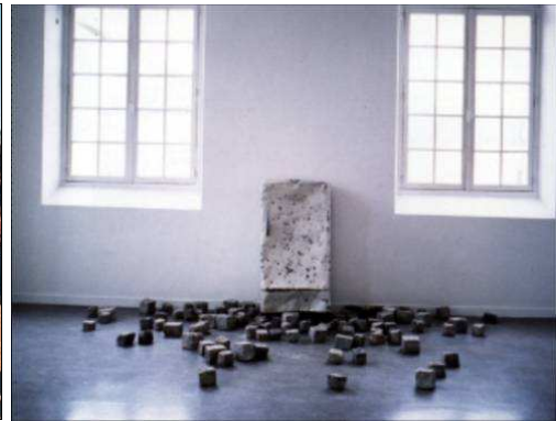
Fig.5: Saint Frigo (1996, courtesy Ministry of Culture, Portugal)

Now an important thing to notice is that this criticism of ideologies – which is also a criticism of “consumption society”, critics usually stress (though it is not the issue according to the artist) – is in line with the preoccupations of the history of modern art throughout the twentieth century, as well as his use of found objects and ‘refuse’, in the questioning of the limits of art and linking art with life. This is the heritage of Marcel Duchamp’s readymade , who definitely opened the way for using whatever types of objects in art.