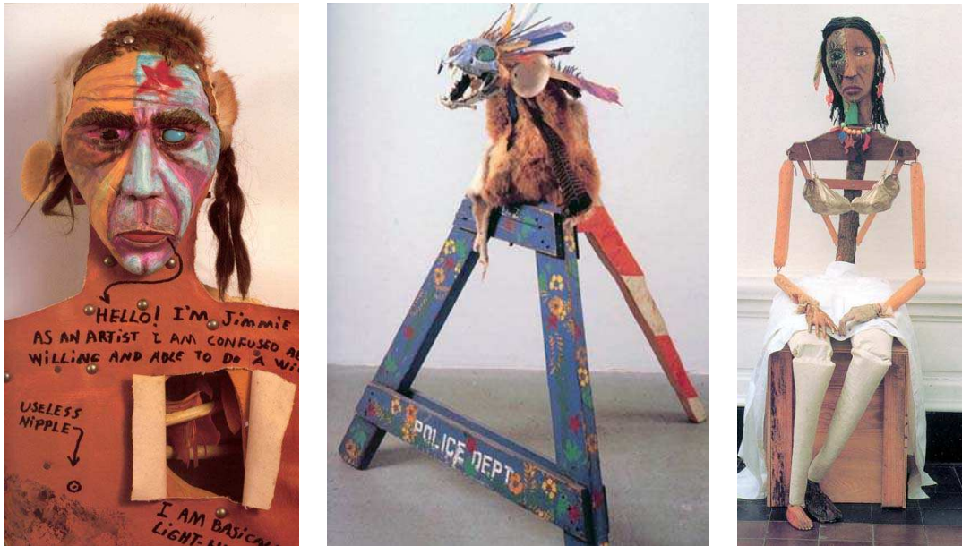
Fig.1: Self-Portrait (1991)

London in 1988, where it was accompanied by a figure of Attakulakula, a Cherokee chief who went to sign a treaty with the king of England in the eighteenth century).