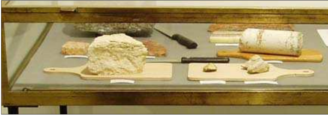
Fig.8: The Dangers of Petrification (2009) (detail) 6