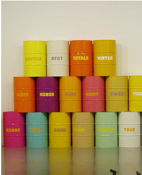
Fig.6: Sweet, Light, Crude (2009, Musée d’Art Moderne de la Ville de Paris)

necessary relationship with the world around (which could be summarized as an ‘importance of the place’), which, in the situation of age-long colonialism and survival, is necessarily political.