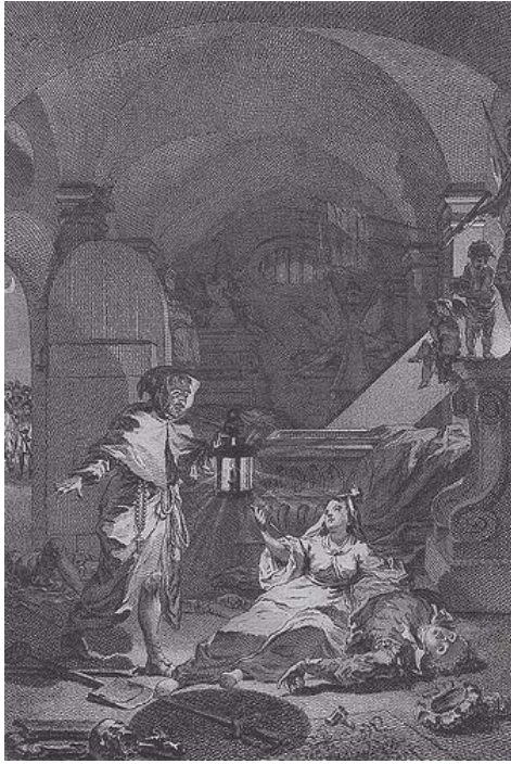
Figure 2: Anthony Walker's 1754 engraving, The Death of Juliet

In fact, if we are interested in visualizing a text theatrically, none of the three most common approaches to digital text visualization is useful. Theatrical texts, unlike other kinds of texts, are incomplete by nature. A theatrical production always incorporates elements other than text. So the process of visualizing a production from a text does not involve selecting from, extracting, and rearranging textual elements in order to reveal hidden meanings, as concordancing does; rather, it involves filling in, adding, and extending the existing fragmentary sequence of textual elements. Even in a proscenium arch theatre, a theatrical production does not arrange text in two-dimensional space, making the print analogy entirely irrelevant.