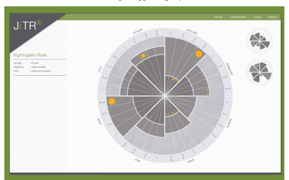
Figure 1. This sketch shows a rose diagram as the underlying surface, with informational pins appearing as yellow dots.

This article will imagine the further extension of JiTR, particularly the structured surfaces prototypes designed by Milena Radzikowska as a member of the INKE project to support information organization by providing a "cognitive interface artefact that provides a layer of meaning that supports the data imposed upon it" (Radzikowska, Ruecker, Brown, Organisciak, & the INKE Research Group, 2011, pp. 3–4). Structured surfaces are an attempt to generalize the functionality that has become widespread in the use of digital maps with interactive pins. The maps provide a layer of information (e.g., geography, streets with their names, and named locations), but that layer is augmented or extended when the user adds pins that represent a new category of information (e.g., restaurants; birth places of authors). In structured surfaces, we have replaced the maps with a variety of data visualizations.