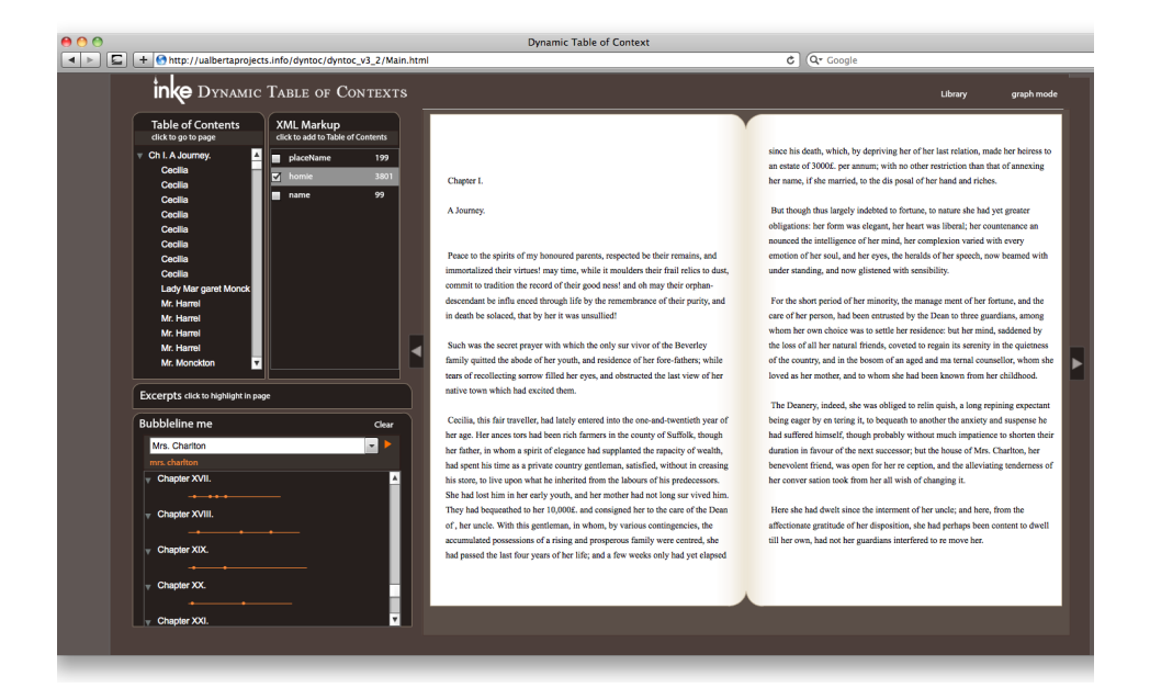
Figure 1. The dynamic TOC with a Bubblelines panel lower left.

In the first area — near the beginning of the book — we are extending our earlier prototype on the dynamic table of contexts or TOC (Ruecker, Brown, Radzikowska, Sinclair, Nelson, Clements, Grundy, Balasz, & Antoniuk, 2009) to support not only the dynamic insertion by the reader of XML-marked passages, but also the provision of related visualizations such as Bubblelines or frequency graphs (Figure 1). We are also exploring the interactive reorganization of the TOC itself, in accordance with the ideas proposed in Nelson (2011). Finally, we are experimenting with embedding the dynamic TOC within other open source reading environments. The goal of the dynamic TOC is to provide a flexible form of prospect and internal linking that can be tailored by the user.