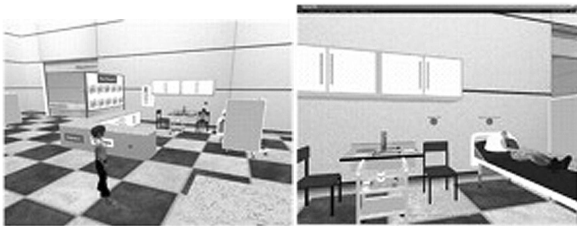
Figure 1 Second Life (SL) virtual patient

Set piece videos to demonstrate the correct way of carrying out various clinical and dispensing procedures were produced with an easy to use video camera with high capacity hard drive. All video material has been provided on the Blackboard VLE in a range of formats both for online viewing and downloading.