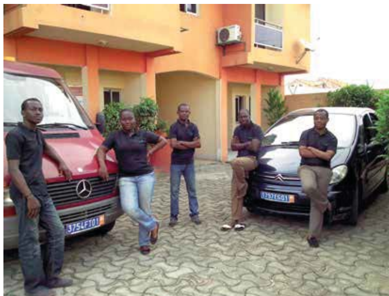
(29) Vivuus Ltd staff members.

oversee collection from other small-farmers and is equipped with a “cargo bike” to facilitate the transport of produce to the market.