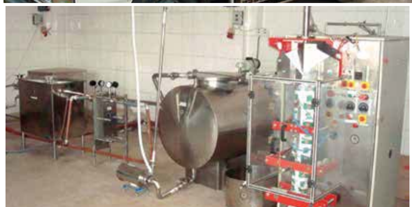
(30) Milk collection from farmers. (31) Distribution truck. (32) Processing facilities.