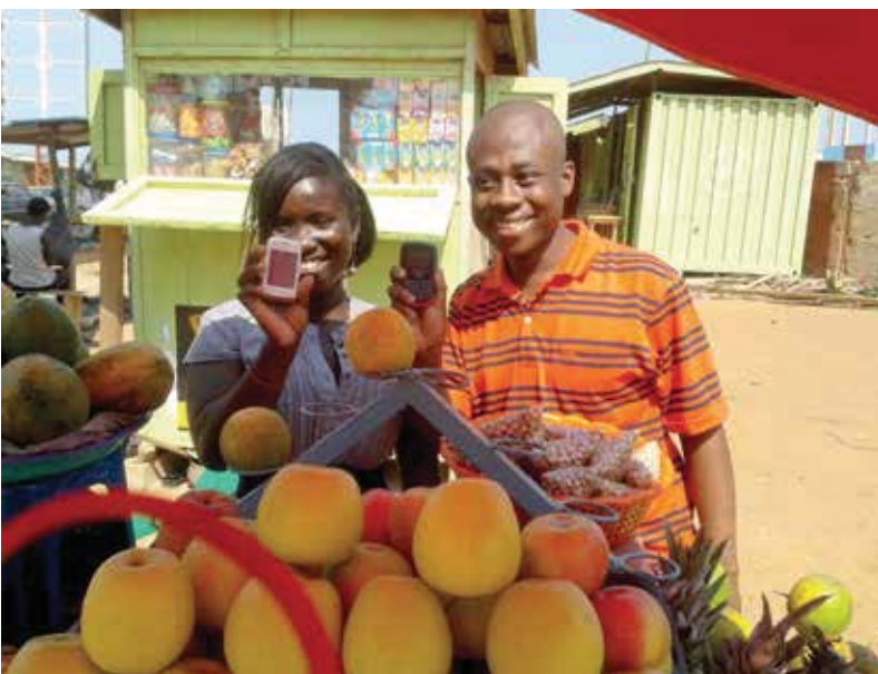
(28) Explaining the mobile-phone-based sales system m-commerce system to a woman vendor.