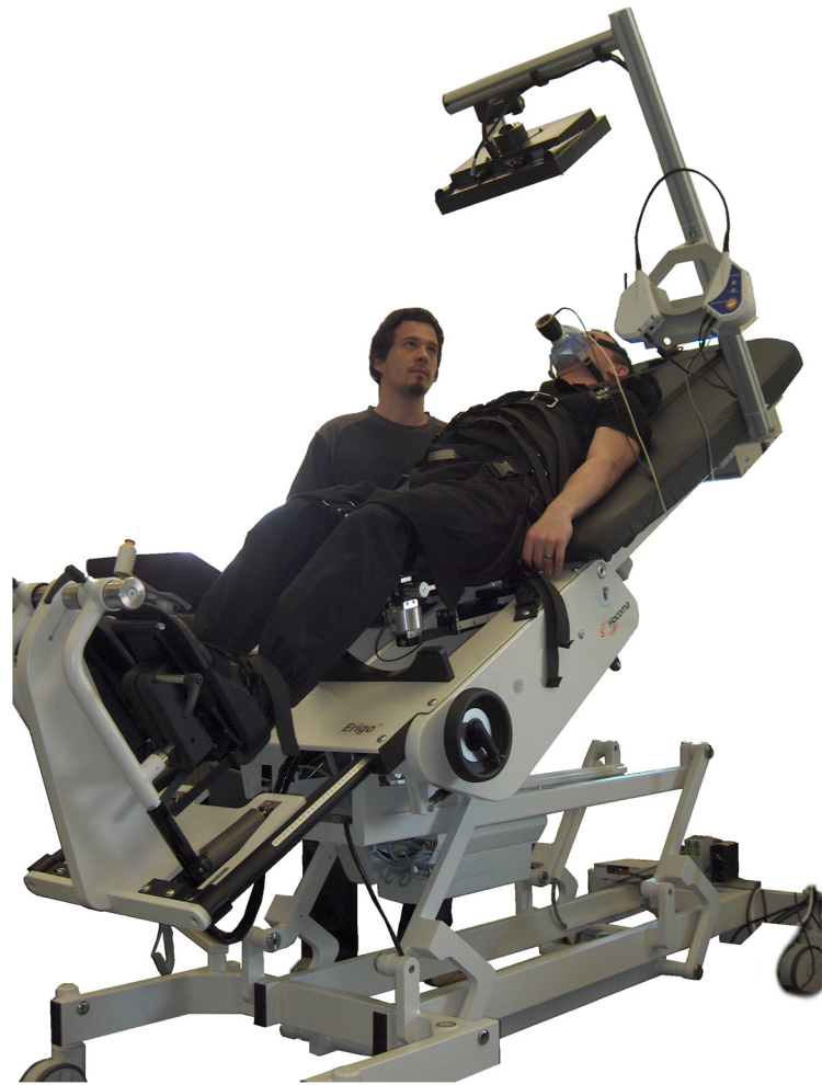
Fig. 1 A modified robotics-assisted tilt table (RATT) with force sensors under the thigh cuffs, visual feedback system and breath-by-breath cardiopulmonary monitoring system

(4) a recovery phase, similar to the initial passive phase, where the RATT moved the patient's legs for 5 min. The termination criteria for the ramp phase followed the American College of Sports Medicine guidelines [18]. Additionally, blood pressure (BP) was used as a termination criterion: systolic BP > 210 mmHg or diastolic BP > 115 mmHg [20].