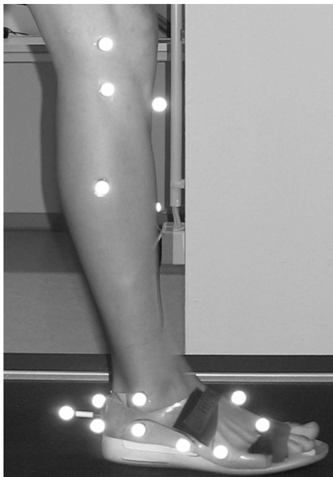
Fig 1. Subjects' lower extremity and foot in customised silicon slippers prepared with skin-based markers following the 'Oxford Foot Model' guidelines.

Six infrared cameras (Vicon MX 3, Vicon Motion Analysis Ltd., Oxford, UK) with a sampling frequency of 200 Hz were used to capture motion. Marker setup preparation consisted of 28 reflective skin markers (Ø 14 mm) following the 'Oxford Foot Model' guidelines [24–26]. Seventeen markers were placed on the lower right leg, 13 of them on the right foot (Fig 1).