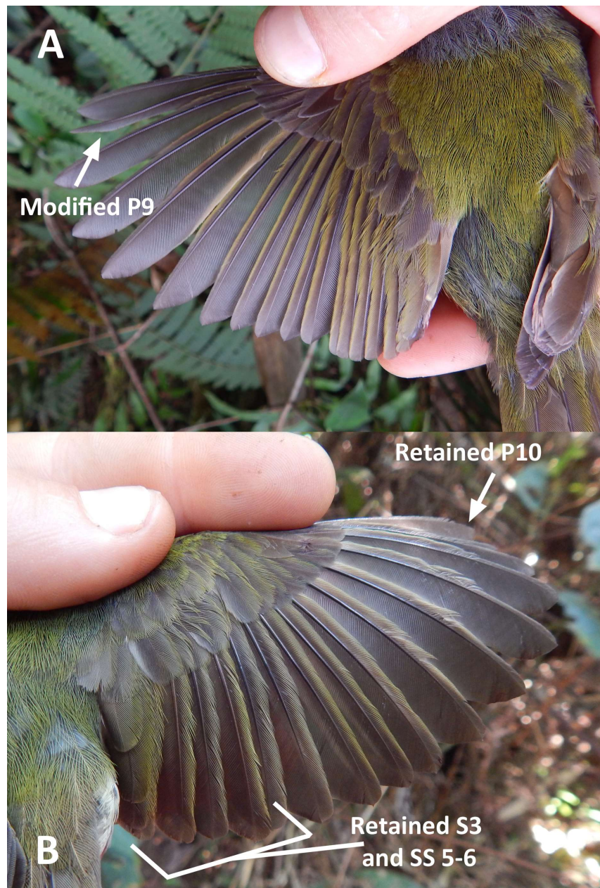
Figure 2. Definitive plumage of male and female Streak-necked Flycatchers ( Mionectes striaticollis ). Males in definitive basic plumage have a deeply notched ninth primary (A). Some females displayed a suspended molt retaining a variable number of secondaries (B). This female was originally banded in 2012 and was recaptured and photographed with the current molt pattern in 2014. 14 October 2014, Wayqecha; 5 November 2014, Wayqecha.

Definitive-plumage individuals showed uniformly dusky greater and primary coverts with bright yellow-green edging and a greenish wash. The upper mandible was jet black. Males and females were indistinguishable by plumage, and we were unable to use breeding criteria to distinguish between sexes.