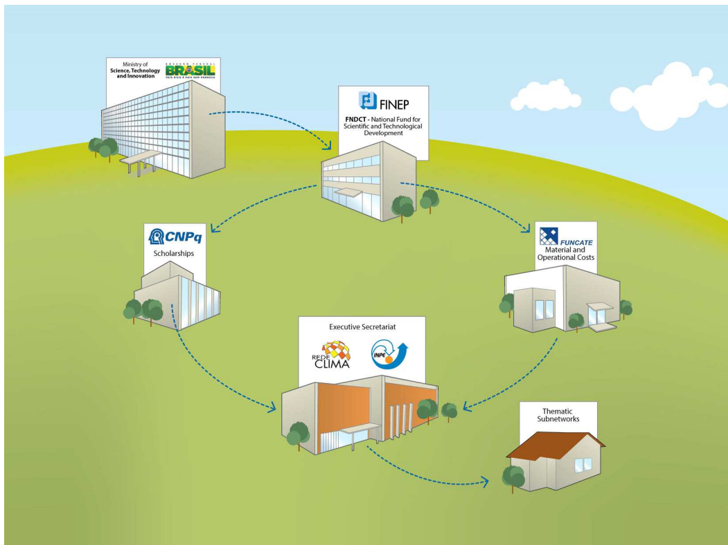
Figure 3 – Financial Resources paths from the origin within the Federal Government to the Sub-Networks of Rede CLIMA.

The development of the Brazilian Earth System Model (BESM) is the central pillar to achieve the goals of Rede Clima. Eventually, BESM will have counterparts of all sub-networks, at the same time that it will generate climate change scenarios for all the Network expert activities.