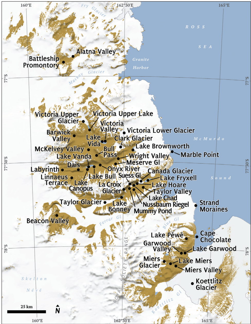
Figure 2. McMurdo Dry Valleys, Antarctica. Labeled areas represent study locations and major geographic features referenced in the tables and text.

but many soils (~35%) lack extractable soil invertebrates and approximately 50% of McMurdo Dry Valleys soils that contain invertebrates have only one invertebrate species (Freckman and Virginia 1997; Wall Freckman and Virginia 1998).