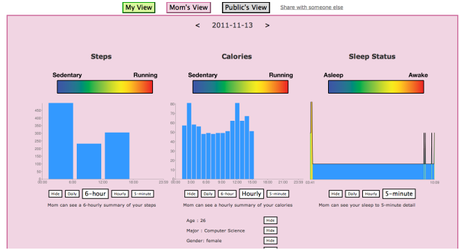
(b) Sharing partner's view (Mom's view)