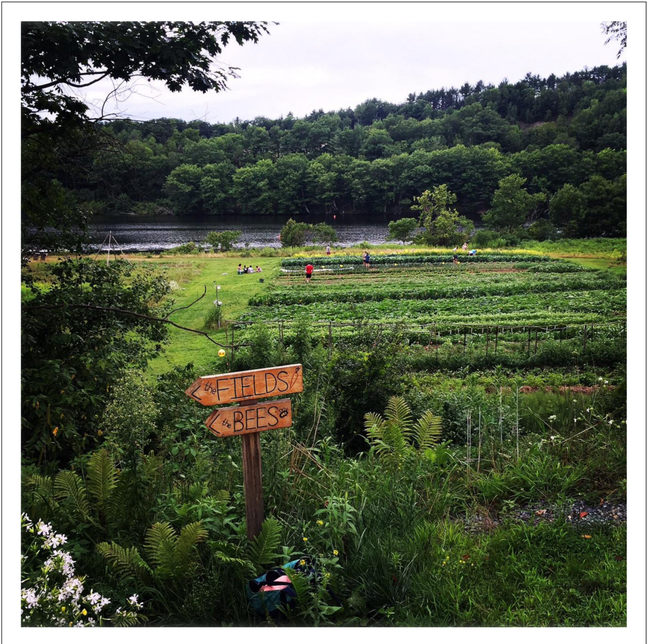
Figure 2: Study Site at Dartmouth Organic Farm. The FARMS model was implemented at the Dartmouth Organic Farm of Dartmouth College in New Hampshire. The study site is located in USDA plant hardiness zone 5A. The production field is located on a flood plain adjacent to the Connecticut River with open grass fields in the immediate surroundings and nestled within a diverse temperate forest. The primary agroecological management practice of the organic-certified production field is annual crop rotation comprising of five botanical families. The tomato cropping experiment presented here was carried out in this annual crop rotation field. DOI: https://doi.org/10.1525/elementa.239.f2

ENVS 25 includes lecture, laboratory, and recitation (X-hour) components. The lecture component meets three times a week for 65 minutes during each meeting. The laboratory component is divided into two lab sections that each meet once per week for three hours at the Dartmouth Organic Farm ( Figure 2 ), located approximately three miles from the Dartmouth College campus. The lab component for ENVS 25 is taught in the focal agricultural production area of the Dartmouth Organic Farm, a 0.5 acre USDA certified organic crop