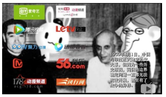
Figure 3. Year , Hare , Affair . Dir. Shi Yi (+-). Season 1, Episode 10, 6:53. 2015. Screen shot.

The subtitle explains that it is a photo taken when the staff at China's nuclear plant pressed the button of China's first nuclear bomb on October 16<sup>th</sup>, 1942.