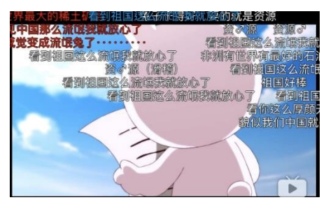
Figure 8. Year, Hare, Affair. Dir. Er Shu (二树). Season 2, Episode 1, 5:03. 2015. Screen shot.

This is a scene when the Rabbits are motivated by their leader to build nuclear weapon (which is called the Mushroom Egg in the animation) with their own hands. The subtitles in the two pictures suggest a big group of Rabbits are chanting "Build the Mushroom Egg!"