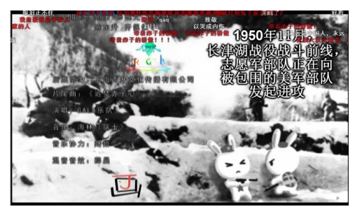
Figure 1: Year, Hare, Affair. Dir. Shi Yi (+-). Season 1, Episode 3, 5:50. 2015. Screen shot. The subtitle explains the real photo was taken at the battle of Chosin Reservoir in North Korea in November 1950 when the People's Volunteer Army of China was attacking the besieged American troops.