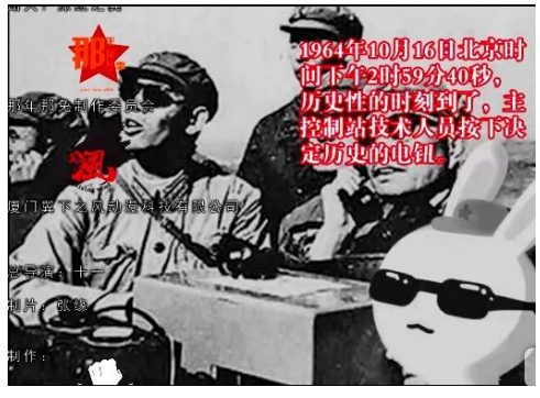
Figure 2: Year, Hare, Affair. Dir. Shi Yi (+-). Season 1, Episode 9, 5:14. 2015. Screen shot.

Figure 1: Year, Hare, Affair. Dir. Shi Yi (+-). Season 1, Episode 3, 5:50. 2015. Screen shot. The subtitle explains the real photo was taken at the battle of Chosin Reservoir in North Korea in November 1950 when the People's Volunteer Army of China was attacking the besieged American troops.