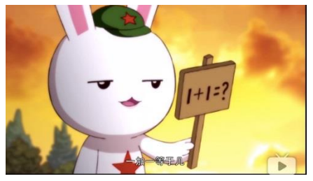
Figure 9 & 10. Year, Hare, Affair. Dr. Er Shu (二树). Season 2, Episode 1, 2:46-2:48. 2015. Screen shot.

After giving African countries an interest-free loan, the Rabbit asks for resources in return. On this picture, the bullet screen comments are filled with comments that read, "seeing our Rabbit is such a bully, I am so relieved" (in Chinese: 看到我兔这么流氓我就放心了).