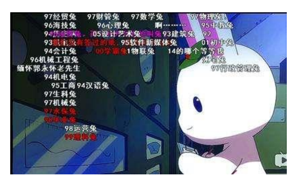
Figure 4. Year, Hare, Affair. Dir. Shi Yi (+-). Season 1, Episode 9, 1:50. 2015. Screen shot.

The subtitle explains the picture was taken on April 1<sup>st</sup>, 1950 when P. R. China and India established a diplomatic relation. The Rabbit is placed next to Zhou Enlai, P. R. China's then Foreign Minister, and the Elephant, the symbol of India in this animation, is placed next to Jawaharlal Nehru.