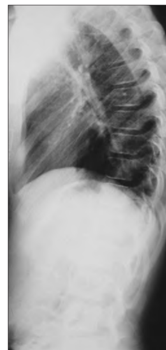
Fig. 1. Plain X-ray.

A common example of poor posture in gymnasts is excessive arching of the back. The manner in which the body is held during both static and dynamic movements can unduly stress sternal structures through maldistribution of forces and body weight over structures that are not suited to the various tasks. 2,7 Sternal stress fractures heal with no sequelae and complications are rare. 9