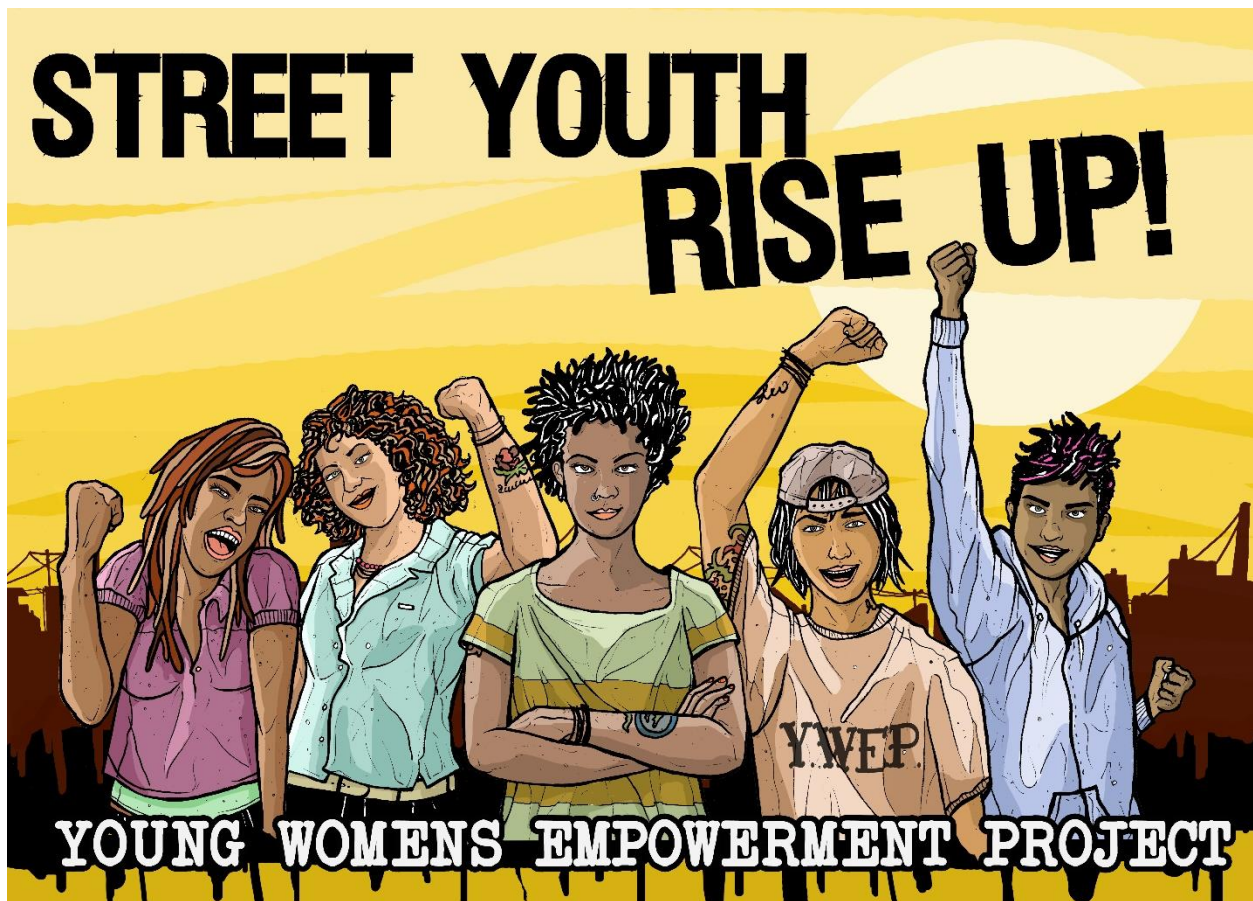
Figure 4 Young Women's Empowerment Project Street Youth Rise Up! campaign image.

GEMS, HRPG, MNWRC, and YWEP all had very different approaches to the issue of youth involvement in the sex trade. While GEMS was a service-based organization that worked closely with the criminal justice system and other social service providers, YWEP was a youth collective that worked to expose police and healthcare provider abuse of youth and to empower youth to take care of themselves outside of these systems. HRPG was a Washington D.C.-based national advocacy organization whereas MNWRC was a service provider working closely with Native American women and girls in the Midwest. All of these organizations resisted racialized rescue narratives and called attention to the systemic failures that made youth vulnerable to entering the youth sex trade in the United States, but these organizations varied in the degree to which they worked within mainstream systems and utilized dominant narratives of victimization (Baker 2018, 102).