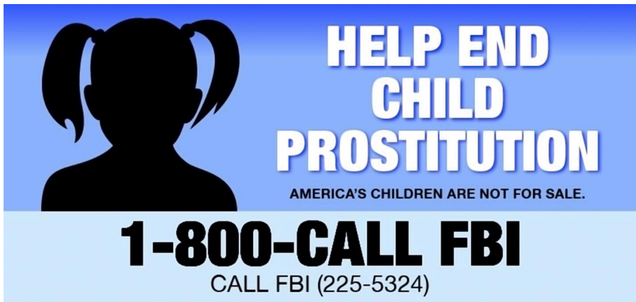
Figure 2 FBI Innocence Lost National Initiative promotional image