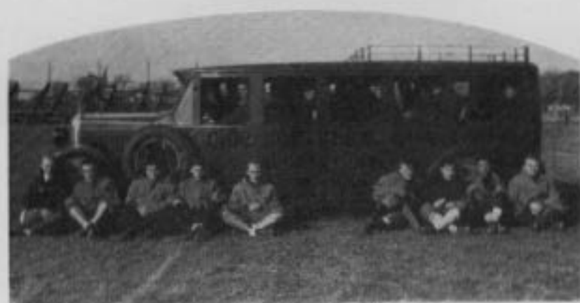
THE UNIVERSITY BUS

The treasurer's office has been buzzing with activity during the Christmas holidays getting out statements calling for the first payment from the thousands of subscribers to the endowment fund. The greater percentage of these subscriptions are small, yet many of them represent a real sacrifice on the part of those making these pledges. The members of the Methodist Church of the West Ohio Conference, many of whom have never seen Ohio Northern, have certainly issued a challenge to the alumni by the splendid response they made in what was unquestionably the darkest hour in the history of Ohio Northern. And the end is not yet. It is often harder to remain in an organization than it is to get into it. The increasing demands upon educational institutions makes this proposition particularly true with them. Ohio Northern's intangible values have increased many fold during the past decade.