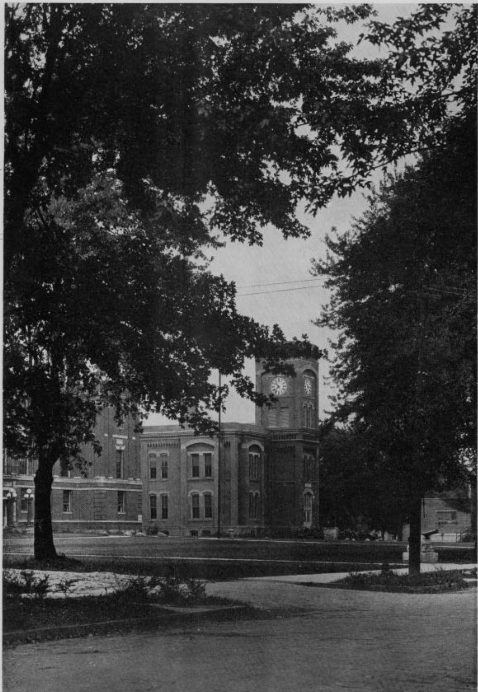
LEHR MEMORIAL (left), HILL BUILDING (clock tower) AND CORNER OF BROWN.