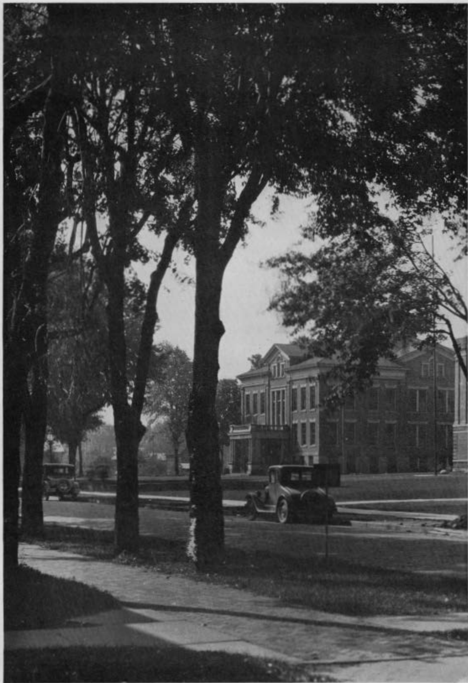
DUKE'S BUILDING, AN ENGINEERING CENTER.