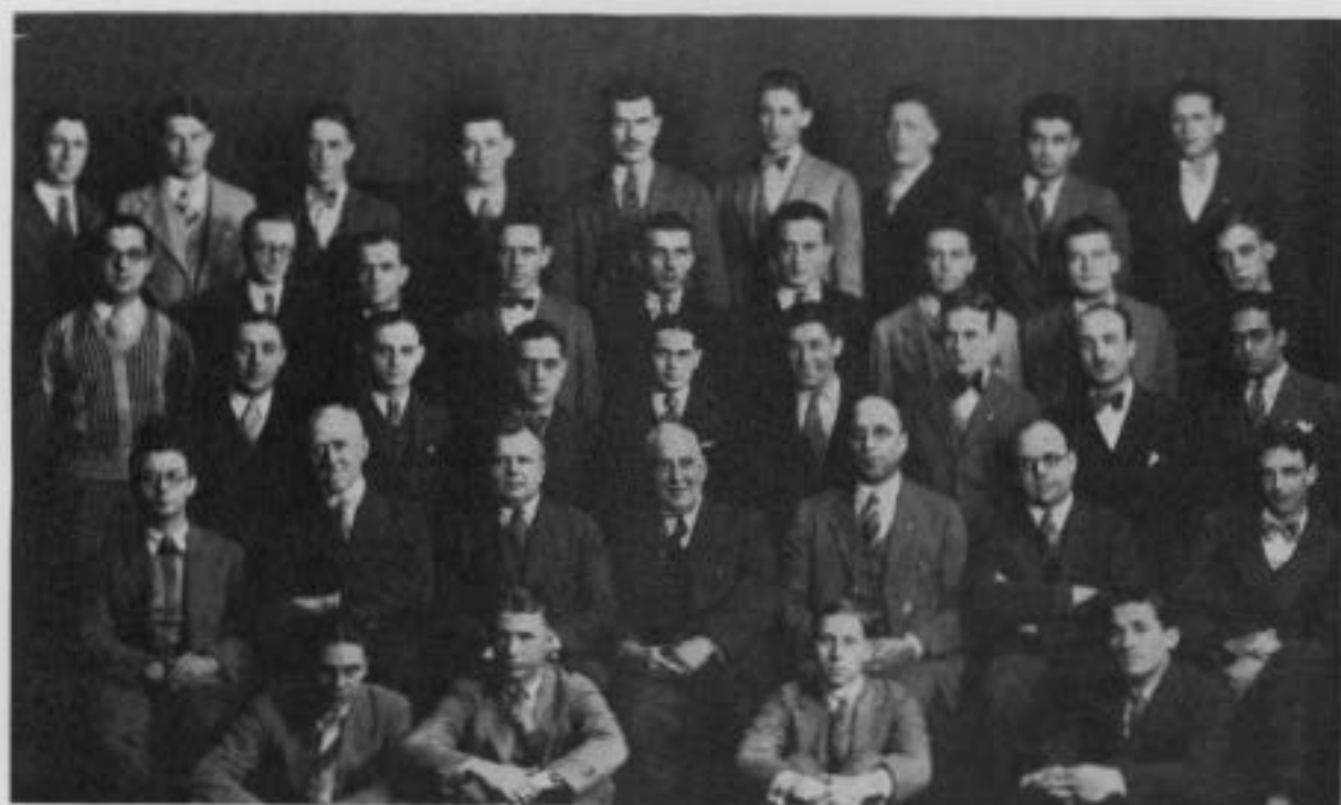
THE LAW FACULTY, AND A FEW LAW STUDENTS, 1927