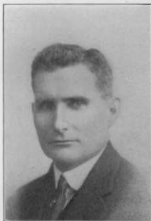
Lt. GOV. EARL D. BLOOM

Born in Wood County, Ohio. Taught country school and practised law in Wood County. Was elected Lieutenant Governor of the State in 1916, 1922 and 1926. Has always resided in Wood County.