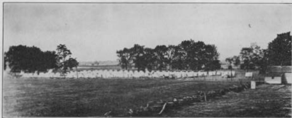
O. N. U. MILITARY CAMP, MAY, 1911, AT LAKE IDLEWILD, NEAR KENTON.