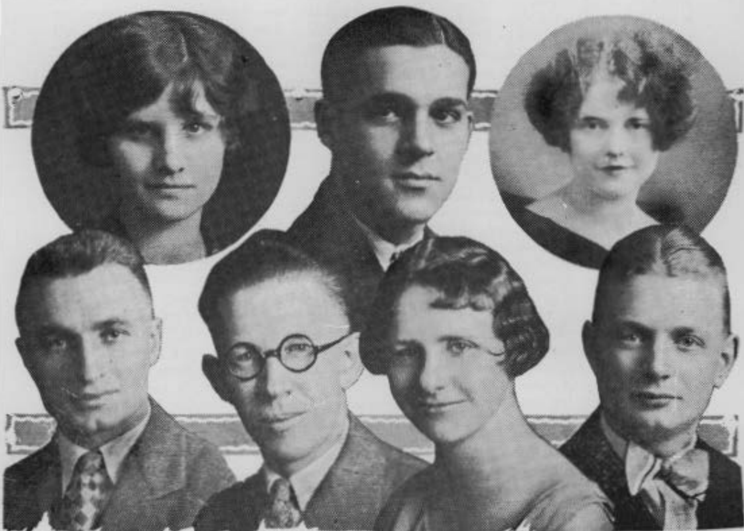
POPULARITY CONTEST WINNERS