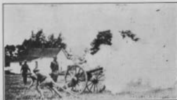
BATTERY PRACTICE, LAKE IDLEWILD, MAY, 1911.

Finally, consider the more immediate advantages of military drill. Military drill was one of the most pleasant and most beneficial of my college activities. Military drill adds a colorful feature to college life. To me it also meant outdoor exercise and recreation, which otherwise I might not have taken, for my studies were heavy. It meant relaxation from the grind of study, a chance to get the cob-webs out of my brain. And above all, the eight-day encampment at Lake Idlewild, a picturesque spot near Kenton that I shall never forget, taught us all some of the rudiments of camp sanitation and other features of army life through which order and good health are maintained.