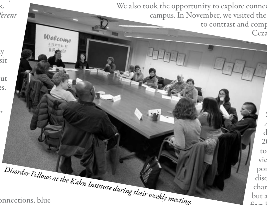
Disorder Fellows at the Kahn Institute during their weekly meeting.

lecture and book signing as well as a colloquium visit to discuss her work. And we plan to wrap up our year with a full-blown Festival of Disorder in late April.