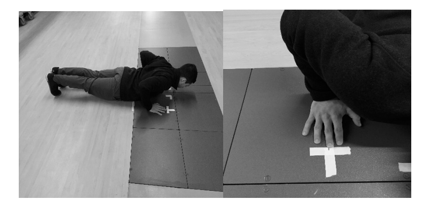
Figure 1. Start position hand placement for explosive push-ups.