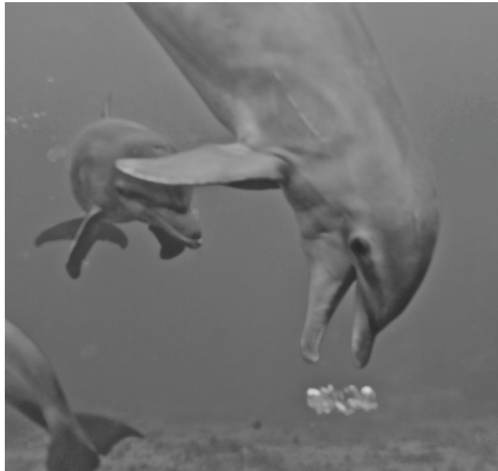
Figure 2. A bold dolphin closely examines a bubble ring while a more timid dolphin looks on.