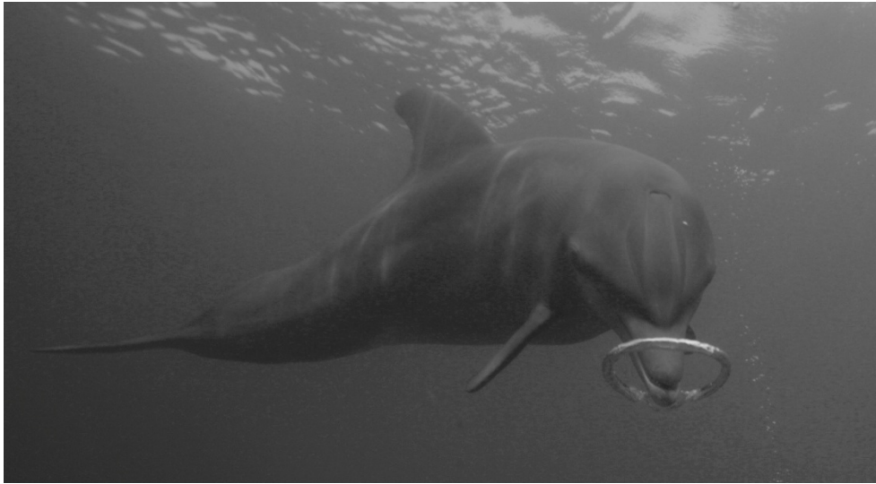
Figure 1. A bold dolphin sticks its rostrum through a bubble ring.

dolphins were also touching the foot of the leg, typically by gently mouthing it as their more adventuresome peers had done days earlier.