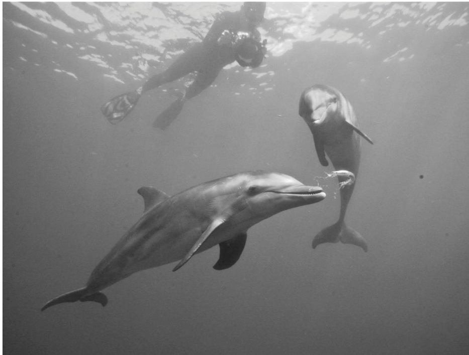
Figure 3. One of the bolder dolphins breaks a bubble ring while another dolphin observes.