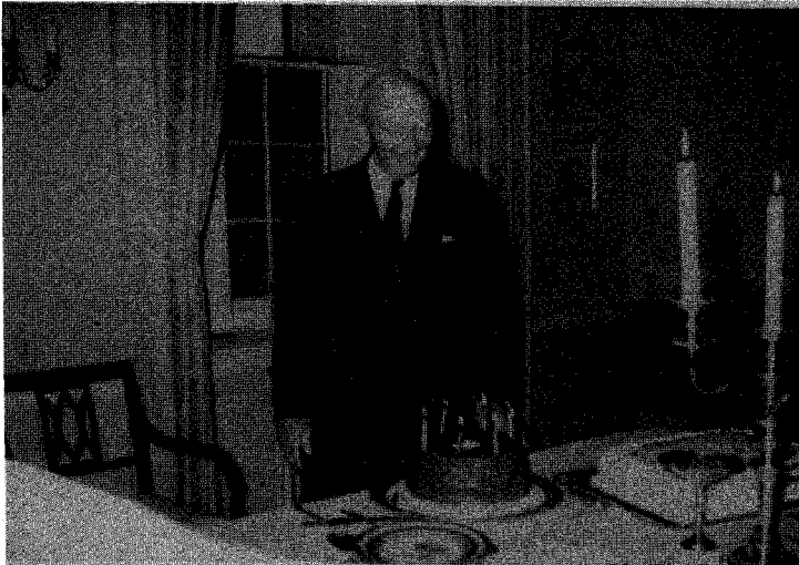
Justice Black at the dinner table next to his chair February 27, 1966