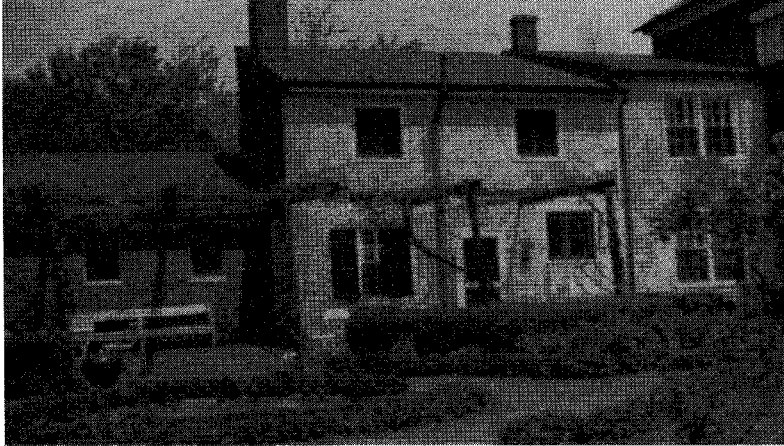
Backyard view of 619 South Lee Street in October of 1956. (Center) clerk apartment & grape arbor. (Left) The bench where Justice Black discussed Brown v. Board of Education. (Right) The main house.