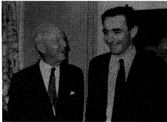
Justice Hugo L. Black and Charles Reich February 27, 1966