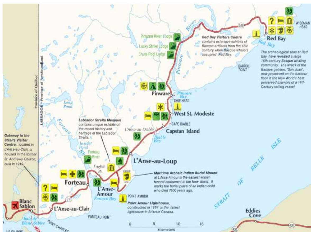
Figure 1: Map of the Labrador Straits (Government of Newfoundland and Labrador, 2009)

The study occurred in the Labrador Straits region as indicated in Figure 1 below.