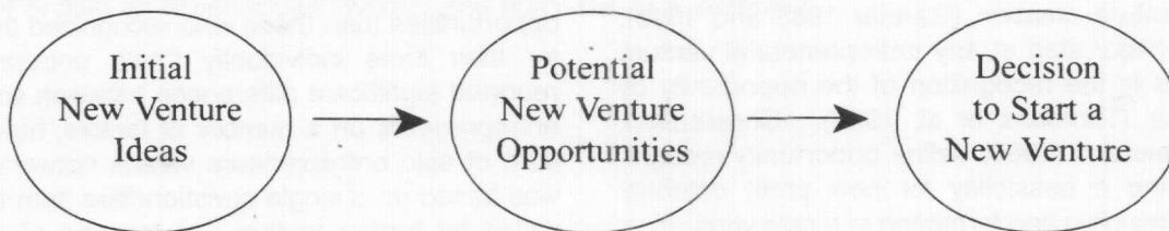
Exhibit 1 Basic Steps of the Opportunity Recognition Process

Some people come up with initial new venture ideas . After so additional thought and/or evaluation, they may recognize that their idea are potential new venture opportunities . With even further thought and consideration one may then decide to start a new venture.