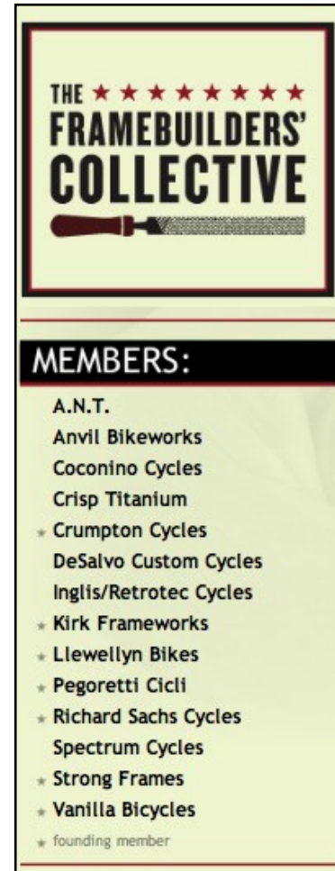
Figure 1: The Framebuilders Collective

Types of Builders and Types of Materials. Custom brands are the large, well-known, high-end bike brands commonly referred to as custom even though the majority of their production has a very limited (or no) actual custom element in the frame. In these instances, the term “custom” refers most often to the parts, which may be custom selected depending on the