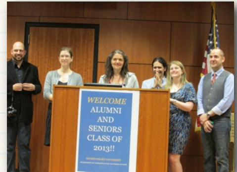
CMS department faculty welcomed seniors and alumni to the annual event.