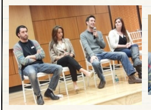
Roundtable panelists share employment insights