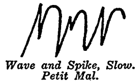
Wave and Spike, Slow. Petit Mal.