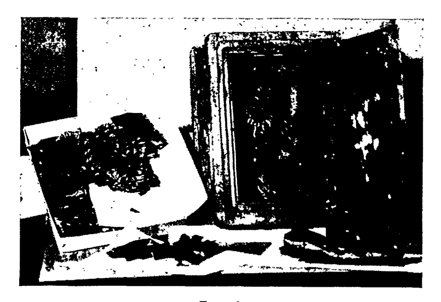
Figure 1 Charred Documents and Iron Box Container Recovered From Ruins of Fire

was for the most part entirely illegible. Since the box was known to have contained a number of bonds, mortgages, and other valuable papers, the writer was requested to make an effort to decipher the writing on the charred contents of the box. (See Figure 1 which shows the charred state of these documents as they appeared when submitted for examination.)