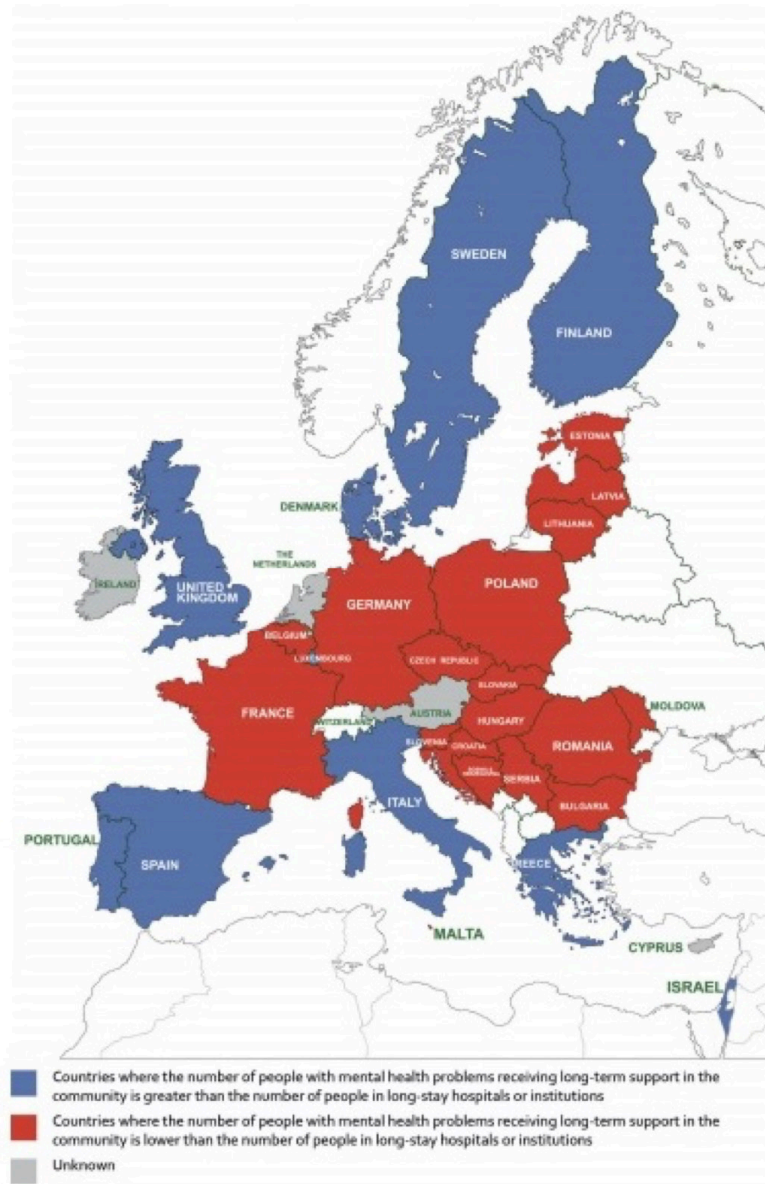
Map 1. Long-term care in institutions vs. community care in the field of mental health care in Europe.

ing and interpretation of Article 19, and the first wave of deinstitutionalisation has been implemented based on these varying concepts.