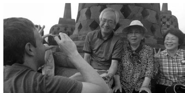
Figure 10 Mark Zuckerberg So Artisan Impromptu Photos at Borobudur

development of architecture or technology, monumental art, city master plan, or landscape design, and fourth, to directly or concretely involved with the phenomenon or an alive tradition, with ideas, or with faith, with artistic works, and the significant universal literature that passing on.