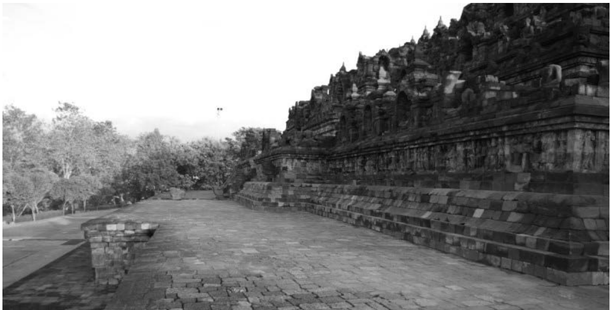
Figure 7 Kamadhatu stage, one of the foot of the temple that contains pictures of human life.

when human still tied with desire or lust. Rupadhatu, 4 steps above, represents human have been released from desire but still tied with form and shapes, at that stage, statues of Buddha coverless-ly open placed. Arupadhatu, 3 steps above, the statues of Buddha installed inside a stupa with holes, as a symbol when human releases from desires, form and shapes. Rupadhatu, the top, represents nirvana, the place where Buddha's lives.