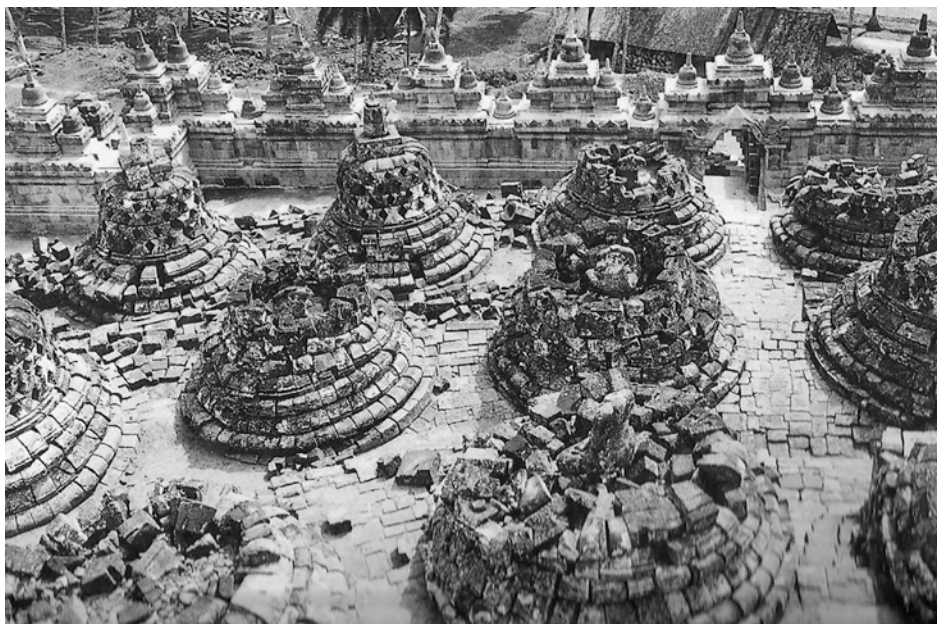
Figure 5 Borobudur temple when first time captured by Dutch historian Van Erp for to be rebuild.

Because deciding about the old, fragile and about to crumble building, Cornelius reported to Raffles about this discovery with some pictures. By this discovery Raffles earned an honor as the first person who start the revitalization of Borobudur temple and earned the world's attention (Soekmono, 1991, 14). In 1835, by the command of Hartman, Second Residence at that time, because his big interest in Borobudur temple, he command the entire citizen to clean all the area so the temple successfully dig and free from any view boundaries.