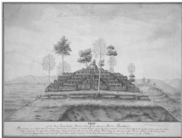
Figure 1 Borobudur temple drawing by P. Beedeer

Syailendra is a king of Medang kingdom from Wangsa that empowered in the years of 792-835 AD (Munoz, 2006, 171). For the architect that honored in designing this temple, as told by hereditary tales, is named Gunadharma. The possibilities of this temple built around the years of 824 AD and finished around the years of 900 AD in the governance of Queen Pramudawardhani, the daughter of Samaratungga 1 .