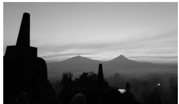
Figure 2 Borobudur was built not far from Mount merapi, the volcanic dust so that it becomes one of the causes of damage of the rock Temple.

Few theories revealed by the experts about why Borobudur temple was abandoned and left unknown by Buddhist civilization in this area. One of the theories which proposed is Borobudur originally built around swamped habitat and then drowned by the eruption of Merapi volcano. That argument was taken from the Kalkutta inscription that written "Amawa" which means "Sea of Milk". That word then translated as lava of Merapi, the possibilities of Merapi buried by cold lava (mud-like materials) around the year of 800 AD, along with the end of Mataram Empire in the year 930 AD the next central civilization and culture of java moving to the east side in the year of 1006 AD. (Murwanto et.al., 2004, 459-463)