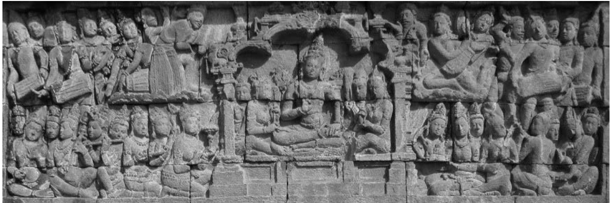
Figure 6 Bodhisattva in nirvana of Tusita scene of Lalitavistara, East Wall, first Panel

Casparis predicted that Bhūmi Sambhāra Bhudhāra in sanksksrut means “hills of group of goodness ten levels of boddhisattwa” is the real name of Borobudur. On the relief, Borobudur tell a story about a legend, with various in its story, there are the story of Wiracita Ramayana, reliefs of Jātaka story, and also Lalita Vistara. Beside that, there are also reliefs that picture the civilization condition at that time. For example, the reliefs about farmer’s activities, that represents the development of farming technologies at that time and reliefs of ships, as representation of development of sailing at that time.